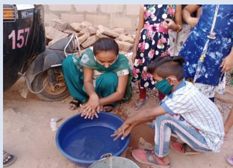
Hand washing and personal hygiene session in Kutch, Gujarat