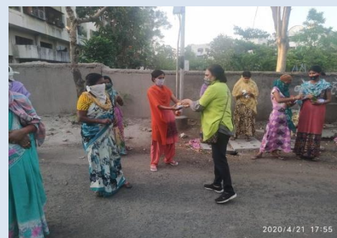
Awareness session on hand washing and distribution of masks and sanitizers, Nagpur, Maharashtra