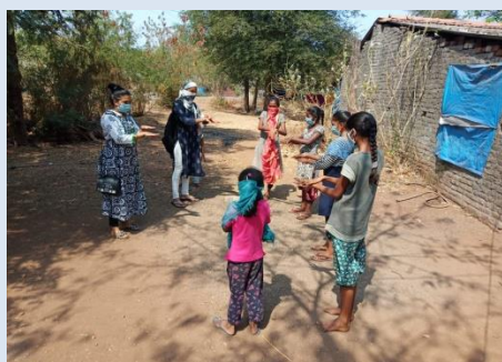
CHILDLINE Tapi conducted a session on hand washing and personal hygiene in Vyara, Gujarat,