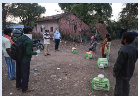
Awareness session on social distancing and groceries distribution in Narsinghpur, Madhya Pradesh