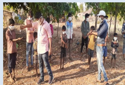
CHILDLINE conducted an awareness session on personal hygiene and hand sanitizing in Dang, Gujarat

In Yavatmal, Maharashtra, CHILDLINE provided food to 18 children and registered 21 migrant families for ration supply to the tehsildar office. With the help of allied systems and other organizations, CHILDLINE Parbhani supported 15 families with ready to eat food.