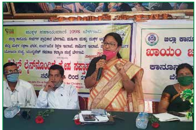
DLSA Community Hall, Belagavi, Karnataka.

CHILDLINE Belagavi organised the CHILDLINE Se Dosti programme with children and concerned district level authorities on the topics of Child Marriage & Child Protection.