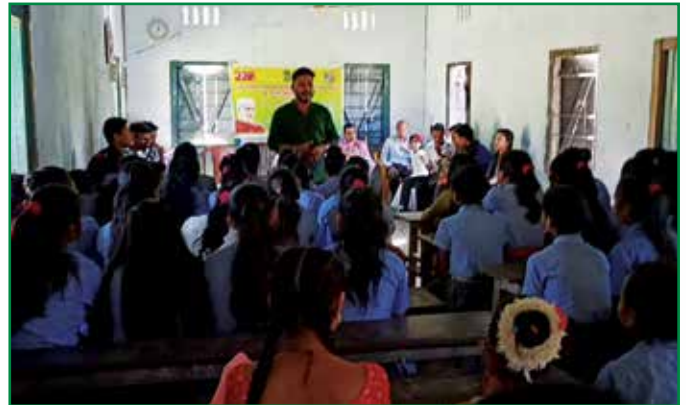
Interaction with children and the local community in Tinsukia, Assam