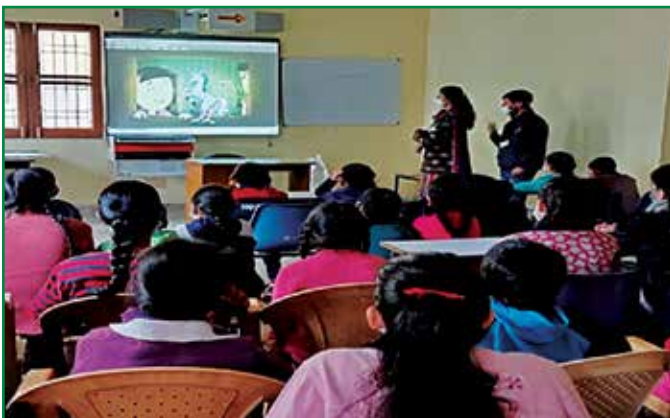
Screening of Film Komal at Railway School Jammu