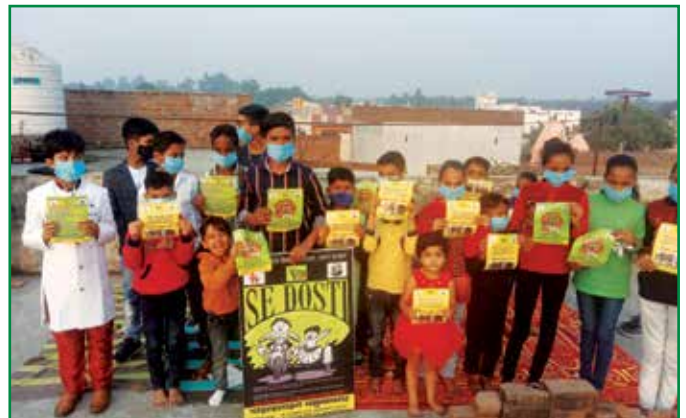
Winners of the diya making and decoration competition in Yamuna Nagar, Haryana