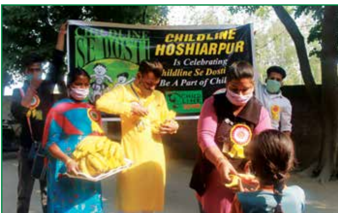
Distributing fruits among local children in Hoshiarpur, Punjab

CHILDLINE Hoshiarpur including Director and CHILDLINE partner inaugurated CHILDLINE Se Dosti week, 2020 at a Slum Area, in Hoshiarpur. The manager of Drugs De-Addiction and Rehabilitation Centre, Hoshiarpur tied Dosti Bands, and Managing Director - Sachdeva Stocks Pvt. Ltd. inaugurated