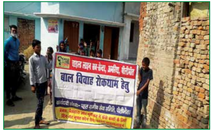
A rally against Child Marriage was organised in Amariya, Pilibhit, Uttar Pradesh during the CHILDLINE Se Dosti week

A rally was organised on the first day of CHILDLINE Se Dosti week with a signature campaign on the second day at Gauhania Chauraha intersection in Pilibhit city. On the third day, a rangoli programme was organised at GGIC Neuria, Pilibhit. On the fourth day, a kite flying programme was organised in village Keshopur Pilibhit. On the fifth day, a Suraksha Badhan programme was held in city, Pilibhit. On the sixth day, a drawing competition programme was organised in Collage, Pilibhit and finally on the seventh day, a CHILDLINE Party programme was organised in Manshik Mandit Shelter Home, Pilibhit.