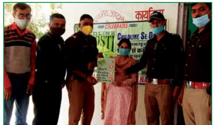
Programme on Child Protection and Child Safety

CHLDLINE Udham Singh Nagar started CHLDLINE Se Dosti week 2020 with a Deepawali Celebration for slum children, where CHLDLINE coordinator shared information about Diwali being a festival of lights. The main objective was to establish coordination among all the departments working for Child Protection and sensitise them about child safety and protection.