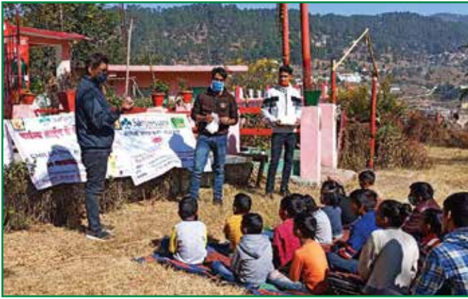
Programme on Child Rights was organised by CHLDLINE