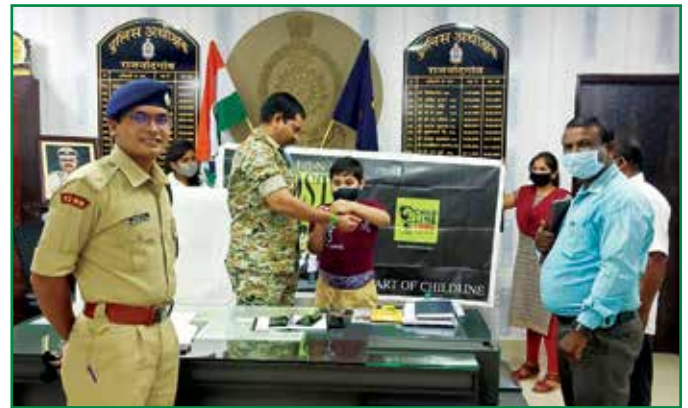
Child tying a friendship band to Superintendent of Police

conducted through this week was raising awareness on Child Rights among different communities in Rajnandgaon.