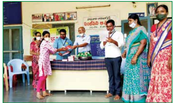
Prize distribution to competition winners, Warangal