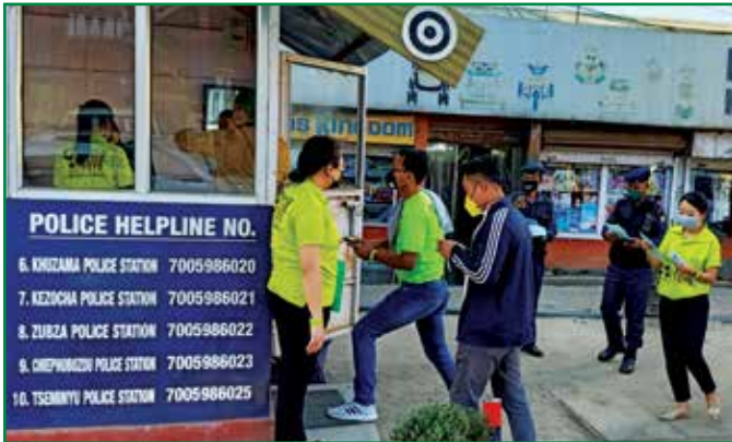
During the CHILDLINE Se Dosti week, masks, PPE kits and nutrition packs were provided to traffic police on duty in Kohima, Nagaland

CHILDLINE Kohima, conducted a range of activities across the city: like community & colony outreach programmes, signature campaigns, tying the suraksha bandhan to police personnel, traffic police & allied Govt. Dept. members. The basic purpose of this campaign was to involve the community, by understanding and recognising children’s issues and being proactive in reducing the vulnerability of children to risks.