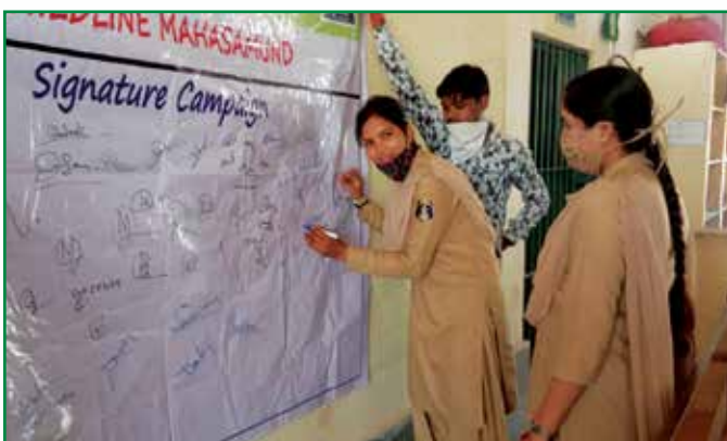
Signature campaign at police station in Mahasamund

The CHILDLINE Mahasamund team celebrated CHILDLINE Se Dosti week with different activities like rallies, signature campaigns, rangoli making, painting competitions etc. to involve different stakeholders in the CHILDLINE Se Dosti week celebration.