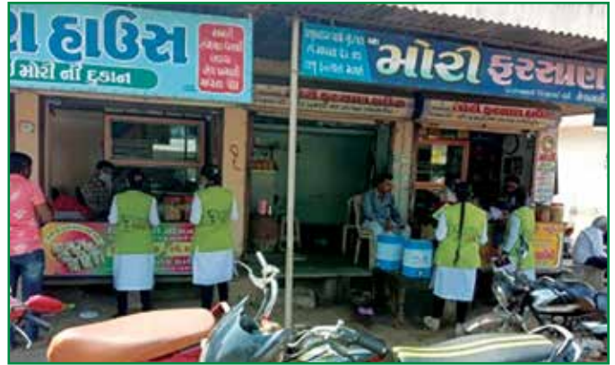
CHILDLINE Botad raising awareness on Child Rights

CHILDLINE Botad, celebrated the first day of CHILDLINE Se Dosti week with Bal Divas, where children played games and shared a story. On the second day, the team spread awareness with the people of Botad city and information about Child Rights was shared with them. Following this, CHILDLINE Se Dosti Banners were signed and dosti bands were tied to several people as part of the initiative to raise awareness on Child Rights.