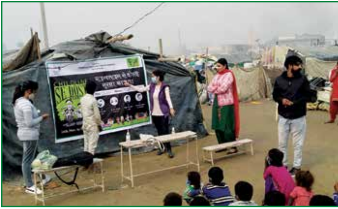
CHILDLINE team organised a cake cutting ceremony at Hisar