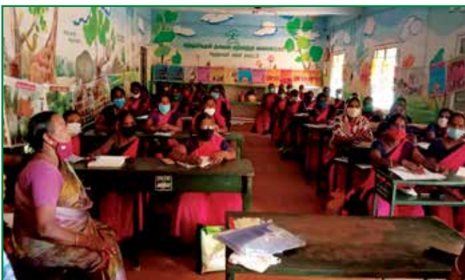
Awareness session on Child Protection

CHILDLINE Ramanathapuram started CHILDLINE Se Dosti week by raising awareness on Child Marriage prevention,