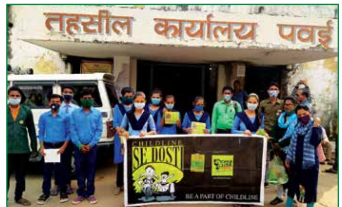
CHLDLINE Se Dosti programme in Pawai Panna