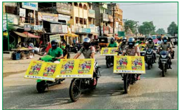
Police took part in Bike Rally to raise awareness on Child Rights

As part of the CHILDLINE Se Dosti week celebration, CHILDLINE Vizianagaram organised bike rallies with the Slogan "Protect Childhood". People who participated in the bike rallies include Police, District Child Protection Unit, Dept. of Women and Child Welfare, District Legal Services Authority etc. Through these rallies, CHILDLINE covered about 500 kilometers and sensitized about 10000 people on Child Rights.