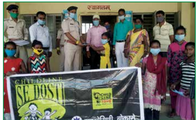
Children tying police the Dosti band at Petarwar Police Station, Bokaro

CHILDLINE Bokaro visited the GRP and RPF personnel at Bokaro railway police station and in nearby stations of other districts like Tata Nagar, Barkhana, Dhanbad, Ranchi etc. while initiating various other activities. The week-long programme was successfully completed by teams from all districts.