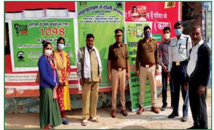
Senior police officials take part in the signature campaign organised by CHLDLINE Mathura in Uttar Pradesh

3. The CHLDLINE team tied Dosti Bands to police officials from different police departments within the districts, while making them aware of child-related issues.