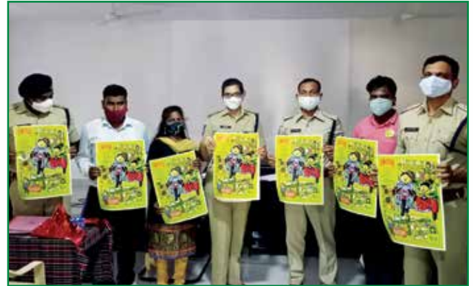
Superintendent of Police launches CHILDLINE poster during CHILDLINE Se Dosti week

Dosti band. The team later inaugurated the CHILDLINE Se Dosti poster. Then the team met with the DSP, DEO and Municipal Commissioner tied the dosti band as well as released the CHILDLINE Se Dosti poster. Throughout the week, several games and awareness sessions about CHILDLINE 1098 & Child Rights were held for participants.