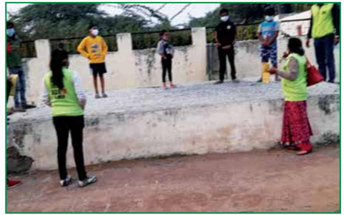
Children participating in games at the Railway colony area in Ajmer

CHILDLINE Ajmer visited the railway colony area and got children to participate in games to enhance their physical fitness. During the games, children were taught the importance of hand sanitizing and correct use of face masks.