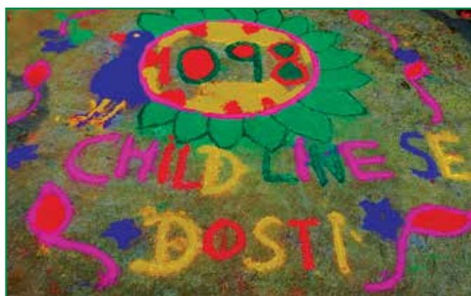
Rangoli competition in Kangra, Himachal Pradesh

CHILDLINE Se Dosti week was celebrated by CHILDLINE Kangra with a range of activities, including a Rangoli Competition, where many children showcased their rangoli making skills. The CHILDLINE team also celebrated Suraksha Bandhan by tying Suraksha Bands to the staff at a children's home for girls in Passu.