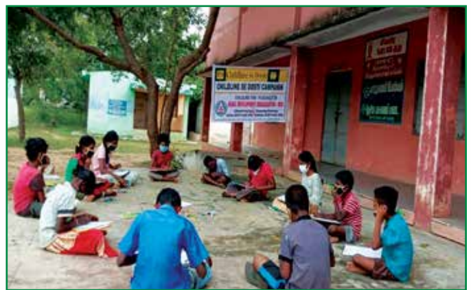
Children at the Child Rights awareness programme

The pandemic never stopped the CHILDLINE Se Dosti celebrations in the state of Tamil Nadu. Instead, we were in full swing and reached out to all the stakeholders, and talking to them about the rights of children and CHILDLINE 1098. A drawing competition was held for children with the title "My Happy World", which was conducted by district CHILDLINE.