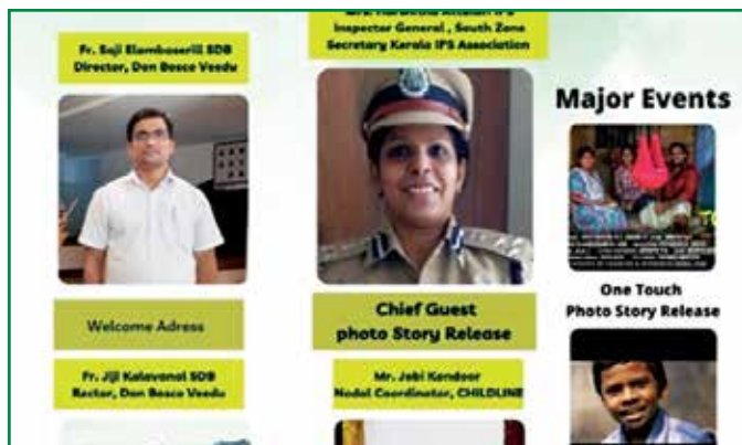
CHIDLINe Se Dosti programme at Trivandrum