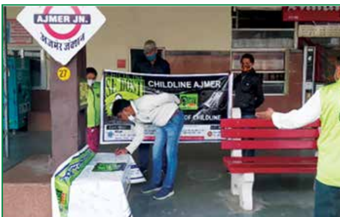
A signature campaign was organised on the Ajmer Railway Station campus

Children's Day and the last day of CHILDLINE Se Dosti week was celebrated with a rally organised to raise awareness on Child Protection Issues at Jaipur Railway Station. The rally was flagged off by the Jaipur Railway Station Director, other Railway officials were also present namely- DCMI Jaipur, Station Dy. SS, Station Master, RPF SI, TC Staff, GRP HC, other NGO staff member and Child Help Desk Staff members.