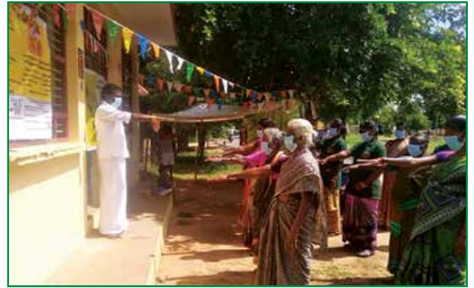
Panchayat president and members taking oath

We launched the CHILDLINE visibility board at the Melasivapuri Panchayat of Ponnamaravathi block. This was followed by taking oath. The visibility board was sponsored by the Panchayat President.