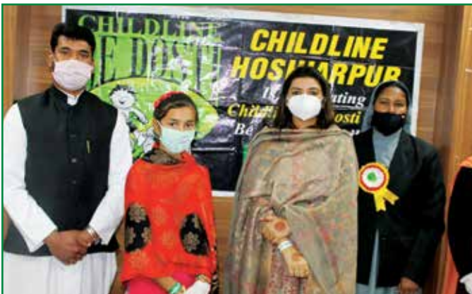
Lady Constable & Team (From Haryana Police Station) motivated children by sharing their personal experiences