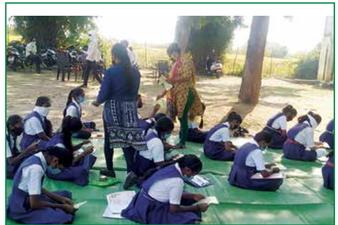
CHILDLINE Chandrapur organised a quiz competition for children at Maroda, Chandrapur