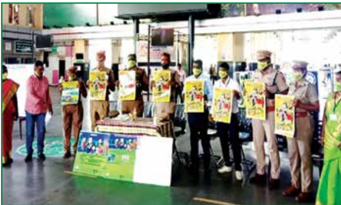
Signature campaign and SOP poster release at MGR Chennai Central Railway Station

We launched the CHILDLINE visibility board at the Melasivapuri Panchayat of Ponnamaravathi block. This was followed by taking oath. The visibility board was sponsored by the Panchayat President.