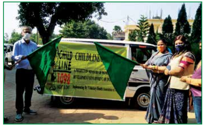
CHILDLINE partner flagging-off the CHILDLINE Se Dosti van