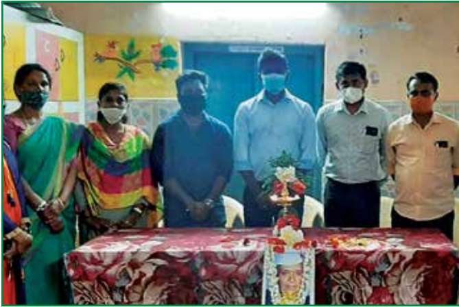
Glimpse of CHILDLINE Se Dosti week celebrations in Kodagu, Karnataka

The programme started by stressing on strengthening the support system for Child Protection. The CHILDLINE Coordinator spoke on Child Marriage and Sexual Abuse.