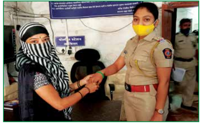
CHILDLINE Satara tying the Dosti band to police officials in Taluka police station, Satara