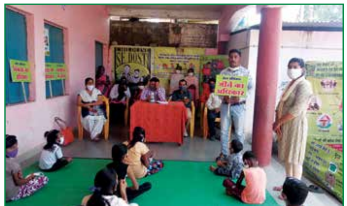
Awareness programme at public school