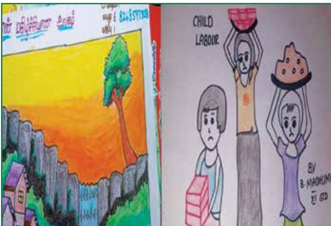
Artworks by children during the drawing competition, organised by CHILDLINE Vellore