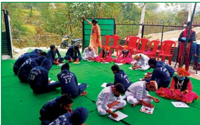
Painting competition organised in Bilaspur, Himachal Pradesh

CHILDLINE Se Dosti week was celebrated by CHILDLINE Bilaspur with a host of activities, including a painting competition where children of all age groups actively participated in the celebration. The team also organised nukkad natak on Child Marriage, and schooled people on the disadvantages of Child Marriage.