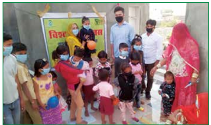
Child Labour awareness programme