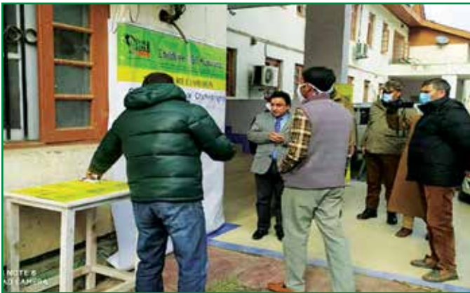
Kupwara Signature Campaign by DC Kupwara