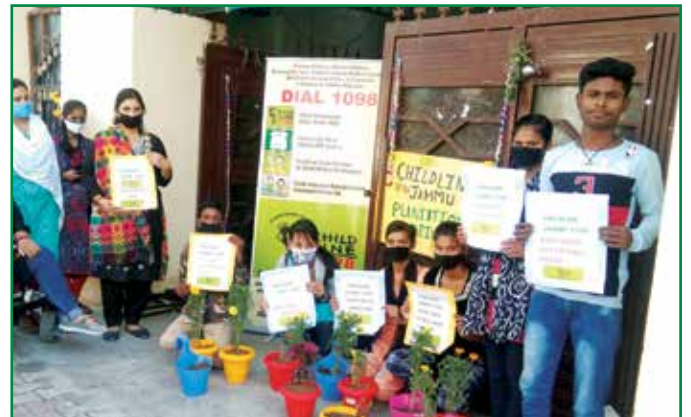
Plantation drive & pledge towards Child Protection

A plantation drive & pledge for Child Protection was held by CHILDLINE Jammu. The programme was very beneficial for children. The theme of the programme was to provide a safety net and eco-friendly environment for all children throughout society.