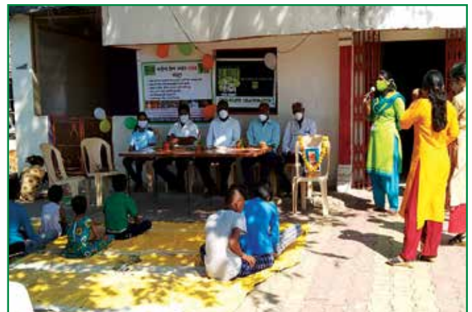
CHILDLINE team members sharing information about CHILDLINE 1098 & Child Rights

CHILDLINE Satara celebrated the CHILDLINE Se Dosti week programme with a signature campaign at a bus stand. This was followed by tying the dosti band to police personnel at Taluka Police station.