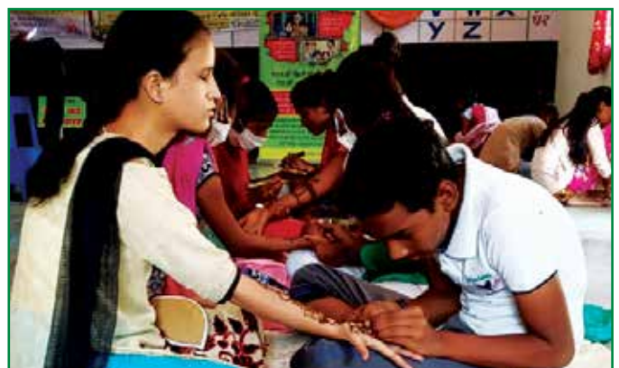
CHILDLINE Burhanpur celebrated a Mehndi competition during the CHILDLINE Se Dosti week