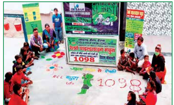
A rangoli competition was organised by Railway CHLDLINE Mathura, during the CHLDLINE Se Dosti week