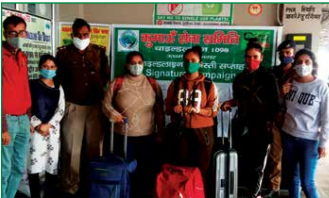
CHLDLINE team with police officials during the Deepawali celebration