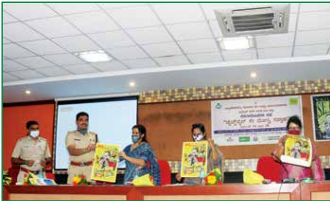
20 th November 2020: CHILDLINE Se Dosti week conclusion programme and meeting with CDPOs, ACDPOs etc.

programme in selected locations where the team received maximum complaints. The team raised awareness about CHILDLINE 1098 by distributing pamphlets. Awareness was raised among auto drivers, bus drivers, conductors, general public and Dosti bands were tied to students and children. About 1000 people were sensitized under this initiative.