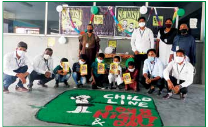
Rangoli competition by CHILDLINE Amritsar, Punjab during CHILDLINE Se Dosti week