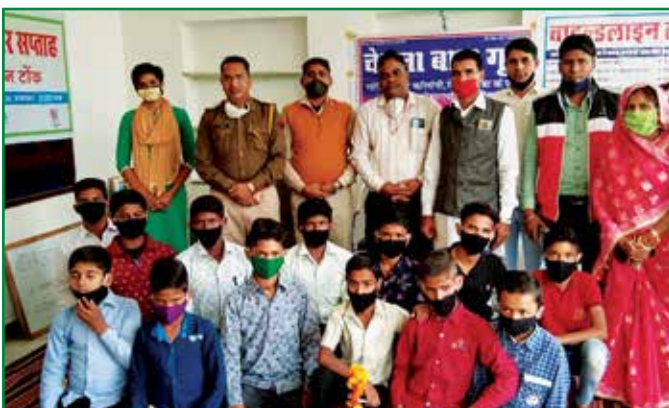
Children were schooled on safe touch and unsafe touch

CHLDLINE Mathura organised the Suraksha Bandhan programme with police officials at the SSP office and children's home. At the SSP office, six children tied the Suraksha Bandhan band to all the police officials. The secretary DLSA, SP Traffic, SJPU inspector, DPO and other police officials were present at the event. The children also asked various questions to the officers present.