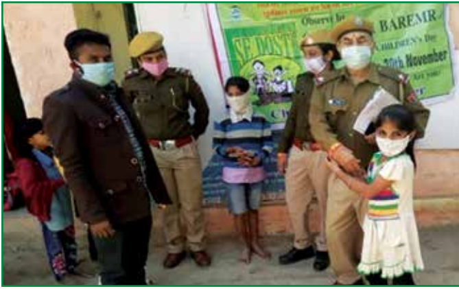
Children tying Dosti bands to police officials