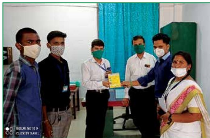
Greeting cards distribution to Ticket Collector Staff