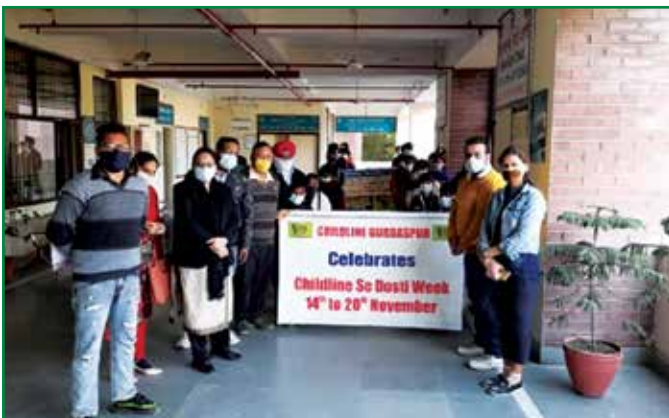
CHILDLINE Se Dosti week rally at Gurdaspur