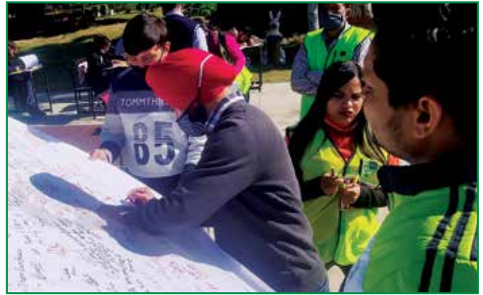
Signature campaign in Chandigarh during the CHILDLINE Se Dosti week

CHILDLINE Chandigarh & Railway CHILDLINE organised a signature campaign at Chandigarh Railway Station and GMSSS-22, to make the concerned Railway & District authorities more sensitive towards child related cases and issues. The signatures were taken on a banner with a message of Child Protection. The people present pledged that they would raise their voice whenever they see children in distress.