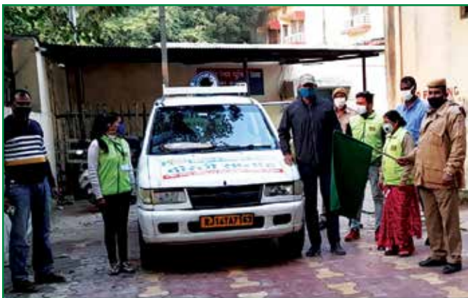
Informative activity conducted using mobile van in Railway colonies, at Frazer Road and Raja cycle

CHILDLINE Ajmer visited the railway colony area and got children to participate in games to enhance their physical fitness. During the games, children were taught the importance of hand sanitizing and correct use of face masks.