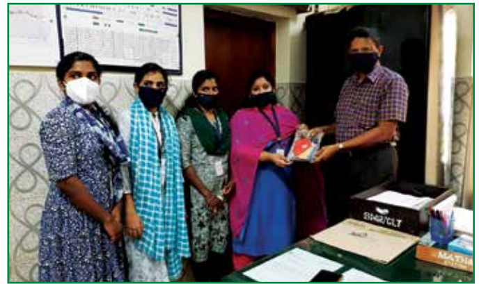
Station Manager receiving masks from Railway CHIDLINe Co-coordinator Child Help Desk

CHIDLINe Trivandrum celebrated its 20 th Anniversary and CHIDLINe Se Dosti week with a district level inauguration of the week-long programme. CHIDLINe Trivandrum director welcomed participants, while CHIDLINe District Coordinator delivered the programme felicitation and the Inspector of Police, Thampanoor tied dosti bands to children, then finally, the CHIDLINe Coordinator delivered the vote of thanks.