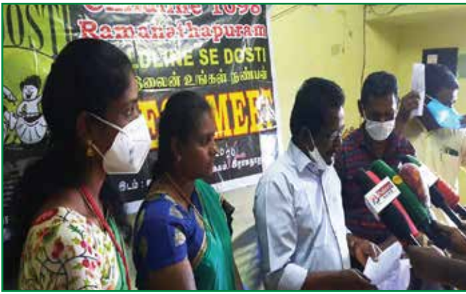
CHILDLINE director in conversation with the press in Ramanathapuram district