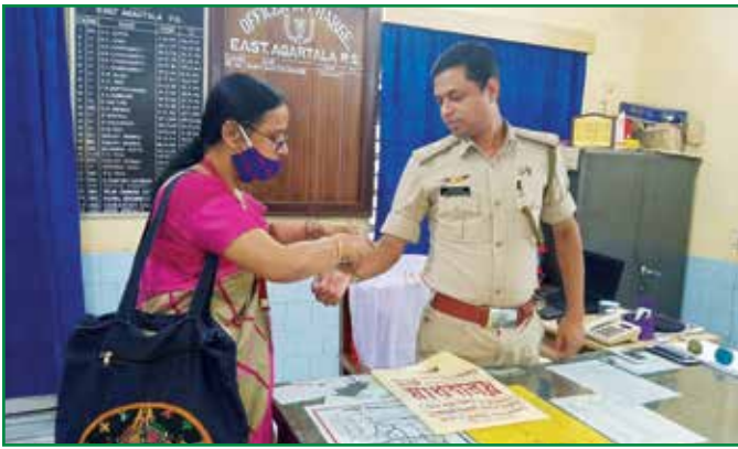
Tying a friendship band during the CHILDLINE Se Dosti week, at Agartala