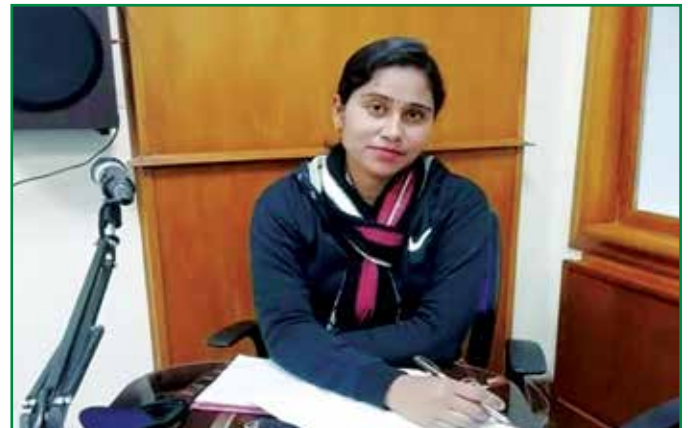
Radio programme organised by CHILDLINE