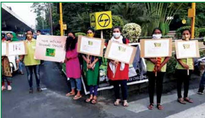
Human Chain organised on Child Rights Day in Fatehgunj, Vadodra