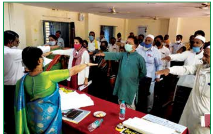
Religious leaders take pledge to prevent Child Marriages in Vikarabad

The CHILDLINE Se Dosti week was celebrated in Vikarabad with DSP, CI, CHILDLINE team members releasing the CHILDLINE Se Dosti poster at the DSP's office. A meeting was held with children on COVID-19 and its effect on children. The team also collected undertaking letters from employers of shops & establishments in Vikarabad town & Parigi town, in regards to preventing Child Labour while informing people about the CLPRA Amend Act 2016 & JJact 2015. The team also met with various religious leaders and explained about CHILDLINE services. DWO and CI also took part in this event; the CI touched upon PCMA 2006 and gave some suggestions to prevent Child Marriages.