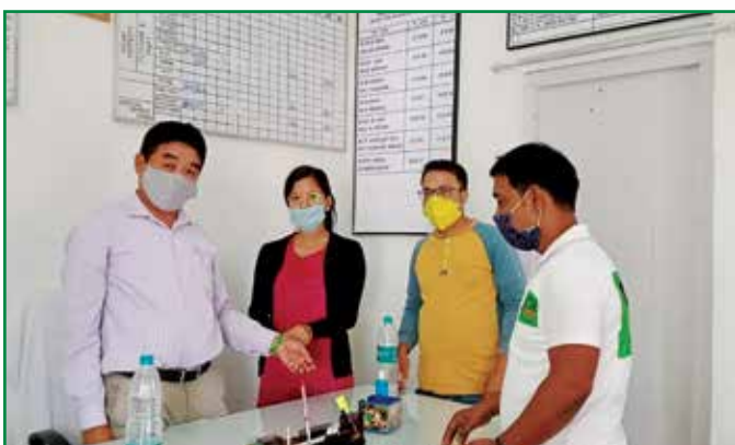
Tying Dosti band to RPF In-charge in Jorhat, Assam

During CHILDLINE Se Dosti week, CHILDLINE Jorhat, visited several police stations in the district to tie dosti bands, a symbol of friendship to the police officers.