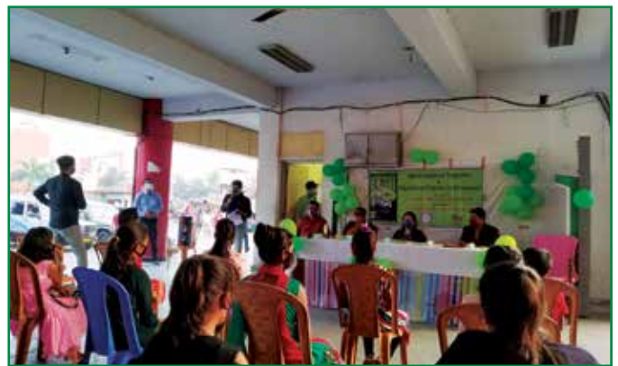
An awareness programme during CHILDLINE Se Dosti week at a bus stand, Agartala