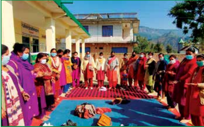
CHILDLINE Se Dosti week celebrations with Anganwadi workers & helpers, Mandi, Himachal Pradesh

CHILDLINE Mandi celebrated CHILDLINE Se Dosti week by organising activities in collaboration with Anganwadi workers & helpers. The team also organised a campaign at all taxi stands, local bus stands, and at the railway station to sensitize taxi drivers and bus drivers about CHILDLINE 1098.