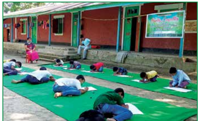
A painting competition organised by CHLDLINE Imphal East, Manipur

CHLDLINE Imphal East celebrated the CHLDLINE Se Dosti week with the campaign objective of adding a million friends.