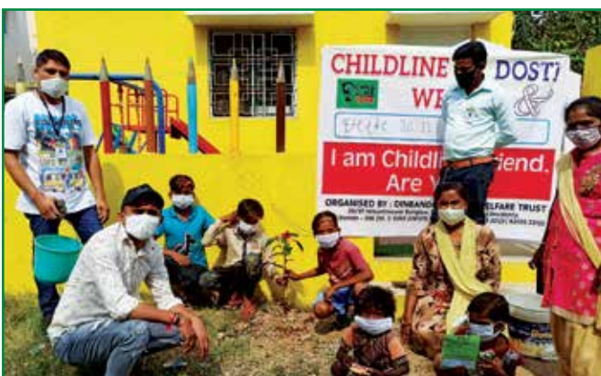
Plantation initiative by the CHILDLINE team at Khariwad

CHILDLINE Daman commenced the CHILDLINE Se Dosti week celebrations with the distribution of clothes and toys to children. This was followed by an event where DCPO Daman and the CHILDLINE team raised awareness on CHILDLINE 1098 services.