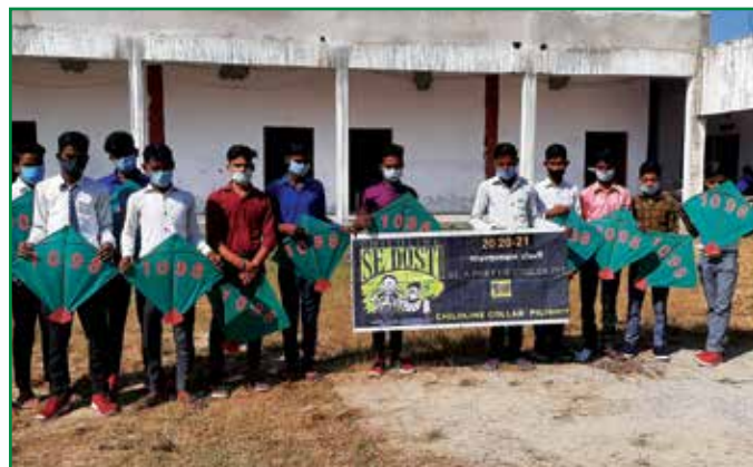
Kite flying competition organised during the CHILDLINE Se Dosti week in Pilibhit, Uttar Pradesh

A rally was organised on the first day of CHILDLINE Se Dosti week with a signature campaign on the second day at Gauhania Chauraha intersection in Pilibhit city. On the third day, a rangoli programme was organised at GGIC Neuria, Pilibhit. On the fourth day, a kite flying programme was organised in village Keshopur Pilibhit. On the fifth day, a Suraksha Badhan programme was held in city, Pilibhit. On the sixth day, a drawing competition programme was organised in Collage, Pilibhit and finally on the seventh day, a CHILDLINE Party programme was organised in Manshik Mandit Shelter Home, Pilibhit.