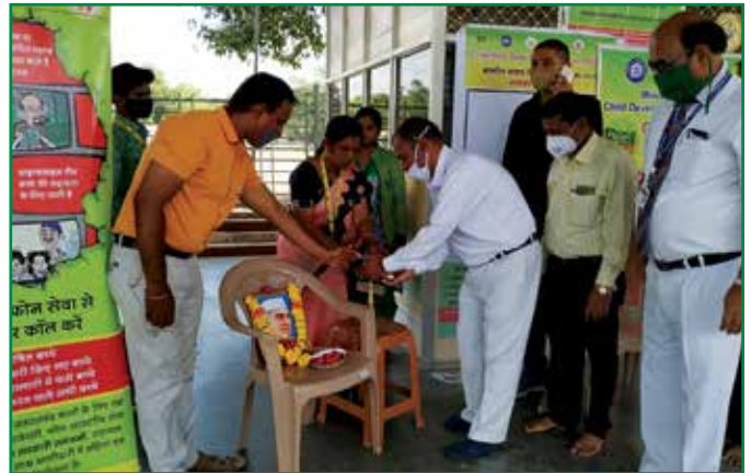
Station Manager, RPF and GRP Inaugurating CHILDLINE Se Dosti week in Solapur