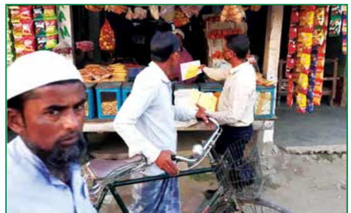
Interaction with the local community and leaflet distribution in Barpeta

CHILDLINE Barpeta, observed CHILDLINE Se Dosti week at Student's Welfare Mission Tapoban Pathsala with the students, in which a drawing competition, quiz and drama was organised by the CHILDLINE team. Few students gave a speech on Shri Pandit Jawaharlal Nehru, and his contribution towards our country.