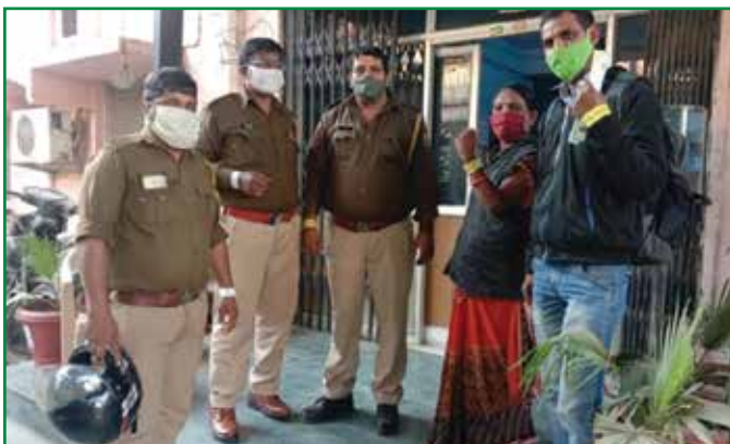
CHILDLINE team tied dosti bands to police officials