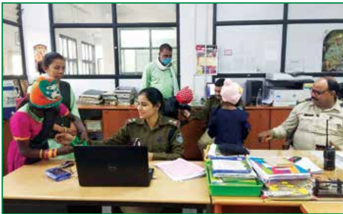
Bhopal CHILDLINE tying friendship bands to Police personnel during the CHILDLINE Se Dosti week

CHILDLINE Bhopal also conducted a session on POCSO with children during the CHILDLINE Se Dosti week.