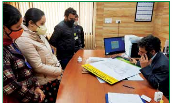
Signature campaign in Jammu

A plantation drive & pledge for Child Protection was held by CHILDLINE Jammu. The programme was very beneficial for children. The theme of the programme was to provide a safety net and eco-friendly environment for all children throughout society.