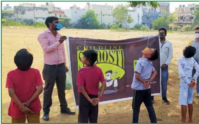
A sports event organised for the children in Raipur, Chattisgarh

The CHILDLINE Raipur team met with Child Welfare Committee members and tied the dosti bands to strengthen their friendly relationship with them. The team along with the children, met the District Programme Officer. They tied the dosti band to him as well.