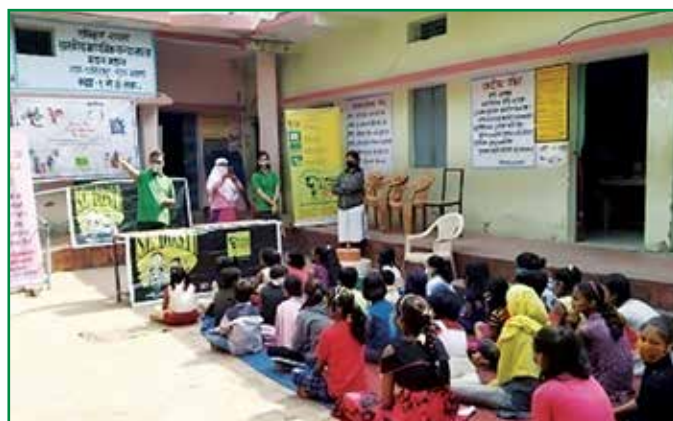
CHILDLINE partner raising awareness on POCSO Act with school children during CHILDLINE Se Dosti week

CHILDLINE Jabalpur conducted an awareness session with school children, where information on the POCSO Act and 1098 was shared. The programme was conducted in the public school where around 30 children participated in the programme.