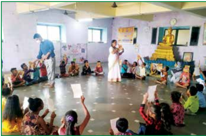
CHILDLINE conducting problem box activity according to PSS manual