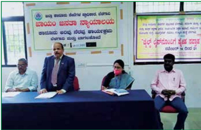
District level authorities participating in CHILDLINE Se Dosti programme to stop Child Marriage for Child Protection

stressing about Child Marriage with suitable examples. He said Child Marriage disproportionately impacts girls, depriving them of their education, health and safety.