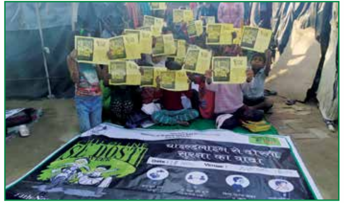
Children holding placards