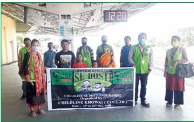
Awareness programme at Teliamura Railway Station, Khowai, Tripura

CHILDLINE Khowai, organised various programmes during CHILDLINE Se Dosti week like a football match, drawing competition, poster making & tying the CHILDLINE Se Dosti band to allied officials. Apart from that, a discussion was conducted with children and the community on how to prevent Covid-19. The right hand washing technique was also demonstrated to children.