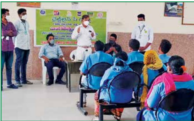
CHILDLINE Nizamabad meeting with the cleaning staff