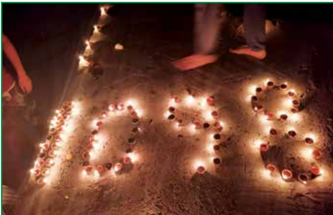
Diwali and CHILDLINE Se Dosti week celebrations in Shimla, Himachal Pradesh

CHILDLINE Shimla celebrated CHILDLINE Se Dosti week by conducting several activities. The team celebrated Diwali as well. The team raised awareness among people about CHILDLINE and Child Rights in Shimla city and the surroundings, via a mobile van using a PA system.