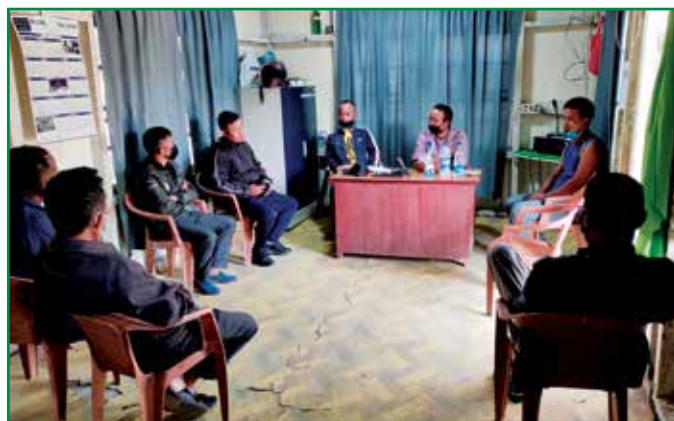
Community leaders meeting organised by CHLDLINE Aizawl during the CHLDLINE Se Dosti week

During the lockdown, children were mentally stressed out, and also there were violations of basic Child Rights at many places. The brief overview of various kinds of activities that were conducted across various districts of Mizoram are mentioned below.