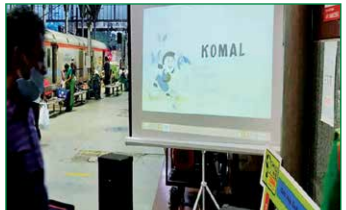
Screening of film Komal at the railway junction in Ramanathapuram