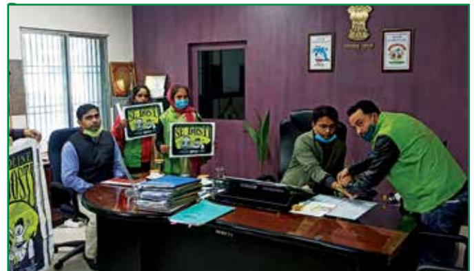
Suraksha Bandhan Campaign by District Magistrate Buxar

CHLDLINE Buxar kickstarted the CHILDLINE Se Dosti week with Suraksha Bandhan, which was tied to the District Administration officials to appreciate their continuous support to ensure Child Protection. Children from different age groups participated in the week-long programme and raised their voice to make Child Protection everybody's priority. Leaflets were distributed by the CHLDLINE Team to spread mass awareness, and make more people aware about CHLDLINE and its activities. The CHLDLINE Team also organised a rangoli and drawing competition for school children.