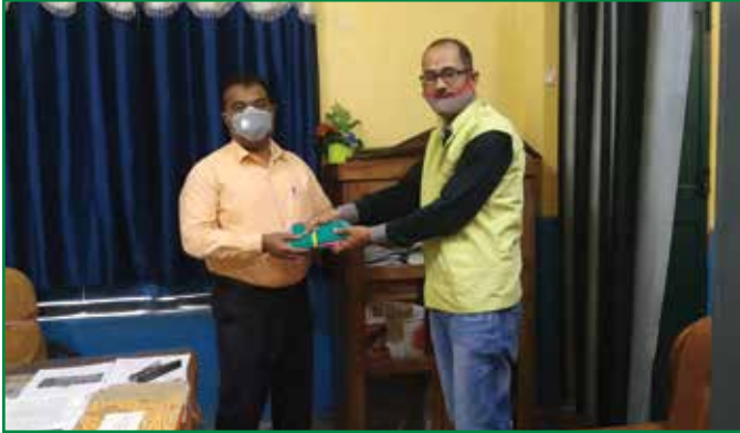
Distributing masks to the RPF personnel.

CHILDLINE Bhojpur celebrated CHILDLINE Se Dosti week with the objective of making a million dosts for CHILDLINE and acquainting people with Child Rights and Child Protection. The Dost could be a student, taxi driver, IT professional, rickshaw puller or housewife. The objective was to reach out to people from different walks of life, get to life, inform them about CHILDLINE 1098 services and sensitize them about vulnerable children by initiating an action towards change.