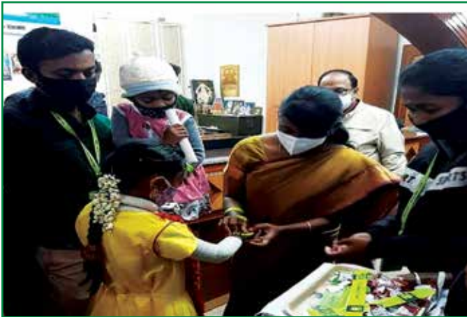
CHILDLINE team member tying the Suraksha band