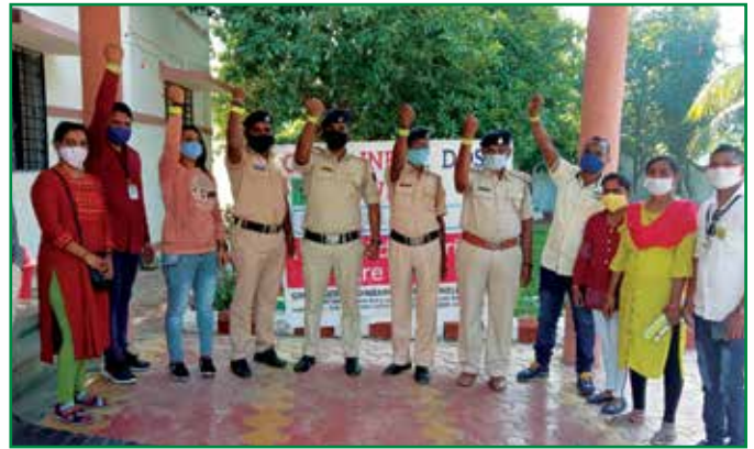
The CHILDLINE team tied dosti bands to Police personnel

The team also distributed kites among children as well as joined them while flying kites in the Ghanchiwad area.