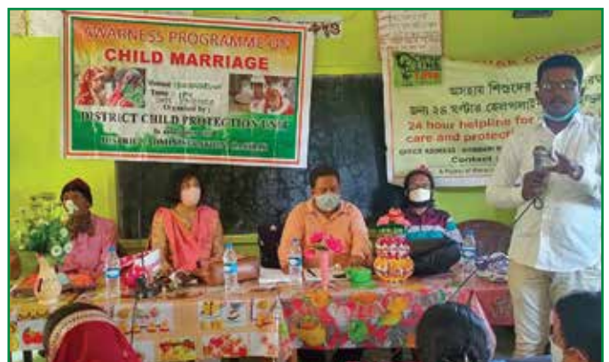
Spreading awareness about CHILDLINE 1098 during the CHILDLINE Se Dosti week in Silchar, Assam

Another awareness programme was conducted with CHILDLINE Silchar on Child Marriage, this time for the Bagbahar Community. The Additional Deputy Commissioner (ADC) was present as Chairperson at the programme.