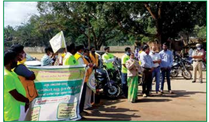
A bike rally against child beggary was organised in Tumkur

This programme was organised with the Women & Child Development Department, TLSA and Lions Club with the support of police and volunteers. The bike rally was a unique and innovative way to raise awareness about CHILDLINE 1098. Nearly 40 adults participated in the programme.