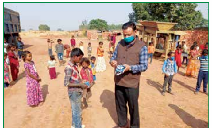
CHILDLINE team distributed masks, notebooks and pens to children during the CHILDLINE Se Dosti week