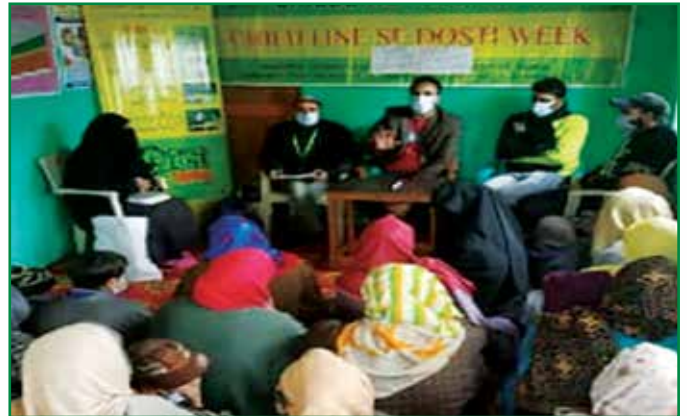
Mental Health Programme Kupwara

From the health department, psychologists were present on this occasion to interact with children, and spread awareness among children about mental health and how to cope with depression.