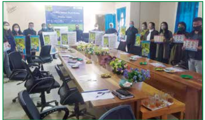
CHILDLINE Advisory Board meeting with CHILDLINE Ukhrul, Manipur

During the week-long campaign, a CHILDLINE Advisory Board meeting was chaired by the Hon'ble Deputy Commissioner of Ukhrul, and attended by 11 CAB members representing the District Administration, Police, Education dept, ICDS, Dist. Social Welfare dept., CWC, DCPU, Revenue dept. and Civil society.