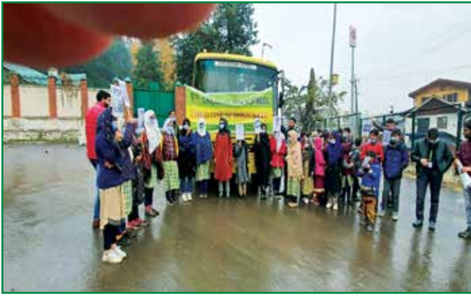
Rally-Deputy Commissioners of CHILDLINE Srinagar, Kathua, Jammu, Doda & Poonch Flagged off rally & In Kupwara-It was flagged off by the SSP

From the health department, psychologists were present on this occasion to interact with children, and spread awareness among children about mental health and how to cope with depression.