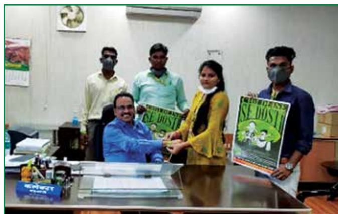
CHLDLINE Barwani tied the Dosti band to Nagar Palika official during CHLDLINE Se Dosti week

On the occasion of Children’s Day, CHLDLINE Barwani tied the Dosti bands to the District Collector & the District Superintendent of Police, who were also informed about CHLDLINE1098.