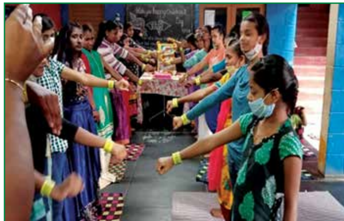
Tying Dosti bands

The Children's Day programme started by tying the Dosti band to all children, and the team shared information about Child Protection and CHILDLINE 1098. There were around 40 participants. CHILDLINE Bengaluru also organised activities like, drawing competitions, essay writing competitions, indoor games, volleyball & cricket for children at a Life Skill Training Centre in Sumanahalli. Around 40 children participated, and prizes were given to the winners.