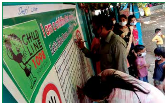
Signature campaign during CHILDLINE Se Dosti week at Varkund