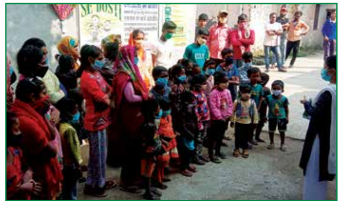
CHLDLINE team distributed masks and sanitizers to children

The CHLDLINE team went to Gram Talhad, where the team of CHLDLINE Almora welcomed the Gram Pradhan of the village, and thanked him for allowing CHLDLINE team to conduct the programme. The children were seated on the field following social distancing and masks were distributed. After that, information was shared on Child Rights with details on 1098.