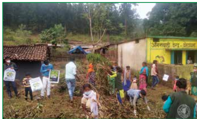
CHILDLINE Jashpur organised a cleanliness drive during CHILDLINE Se Dosti week

The children tied friendship bands to DM Jashpur, SP Jashpur, MLA Jashpur and DPO Jashpur. A signature campaign was also organised to raise awareness on Child Rights.