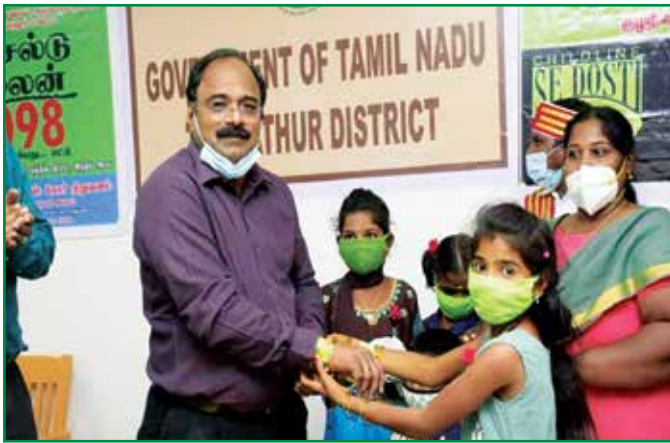
Children tying dosti band to the S.P of Tirupathur district