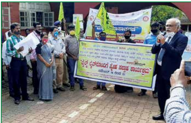
CHILDLINE Belagavi organised a rally for school children on Child Protection & COVID-19