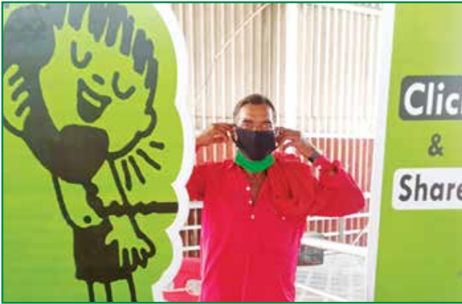
CHILDLINE photo frame for train passengers

A photo frame titled "CHILDLINE Ka Dost" was installed at different places by the team for train passengers and other railway staff to take pictures and upload on social media.