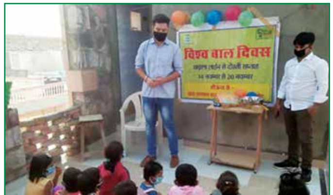
An awareness programme was organised by CHILDLINE on World Children's Day