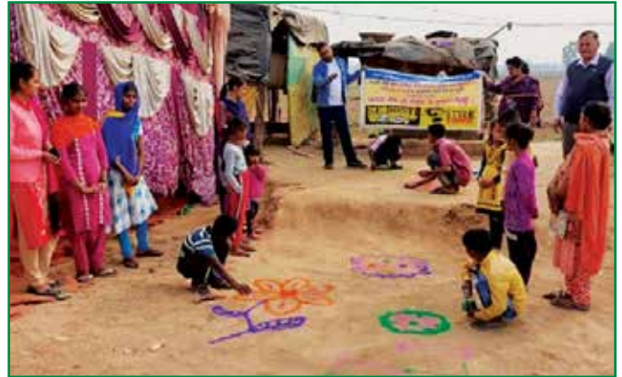
Rangoli Competition in a slum area on the first day of CHILDLINE Se Dosti week