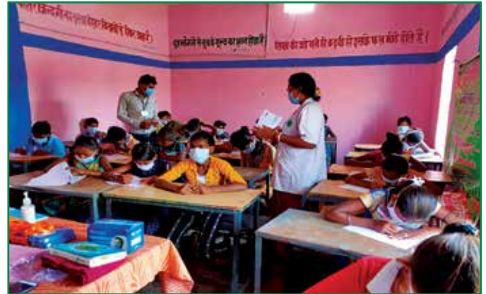
General knowledge competition for children during the CHILDLINE Se Dosti week in Bemetara, Chattisgarh

During the CHILDLINE Se Dosti week, the team met with the Child Welfare Committee members, and the children tied friendship bands to staff members of the local municipality.