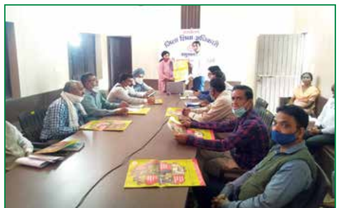
Interactive session with Education Officers during the CHLDLINE Se Dosti week

The CHLDLINE Se Dosti campaign reached out to villagers in Tapu Kamalpur where the children participated in a diya making and decoration competition as Diwali was coming up. The CHLDLINE team encouraged children by giving them prizes and