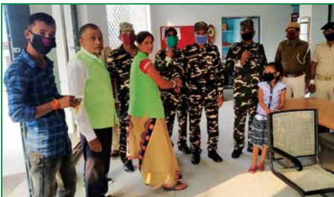
Jamui team tying the Suraksha Band to CRPF official

As a new district of CHILDLINE, celebration of CHILDLINE Se Dosti week saw awareness grown rapidly on CHILDLINE 1098 and children tied dosti bands to different stakeholders in the district.