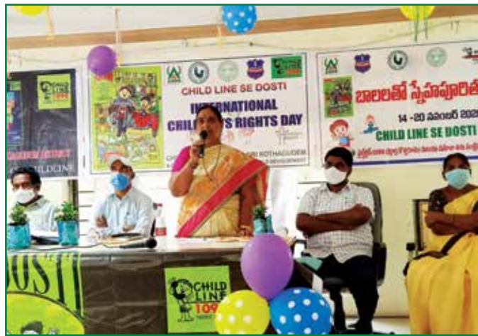
District-level meeting in Bhadradi Kothagudem District