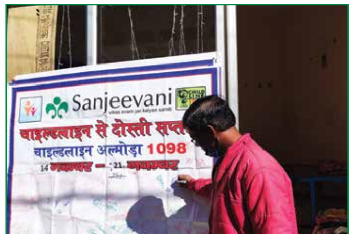
A signature campaign was organised by the CHILDLINE team