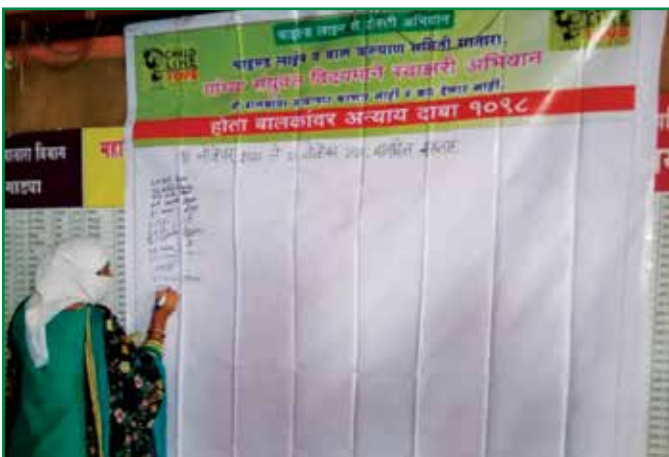
CHILDLINE Satara hosting a signature campaign at a bus stand during the CHILDLINE Se Dosti week programme