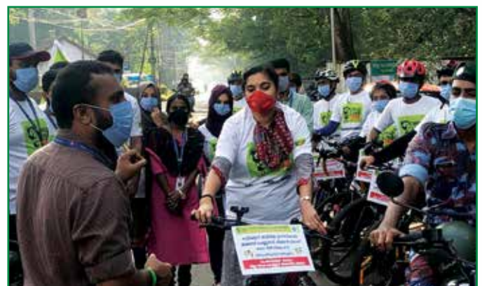
CHIDLINe Malappuram conducted a district cycle ride against Child Abuse

CHIDLINe Se Dosti week was celebrated with CHIDLINe Malappuram conducting a cycle ride in association with the DLSA. The theme of the ride was safe childhood. District Legal Services Authority secretary Hon. Sub Judge inaugurated the programme, and 18 professional riders from different parts of the district participated. It was a nice and colorful programme. The team visited more than 10 main cities, and shared various child protection messages. The ride also saluted the corona warriors for their efforts.