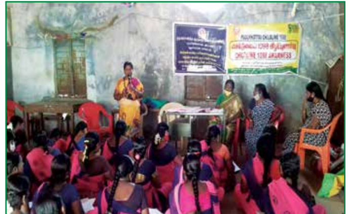
CHILDLINE programme with volunteers on Child Protection