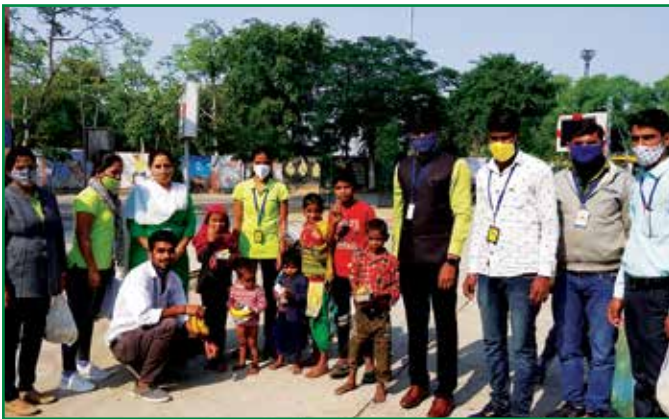
Distributing food packets to children in Jaipur, Rajasthan