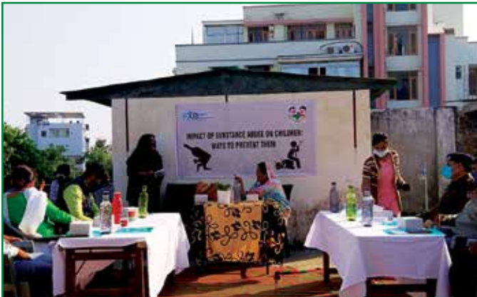
CHILDLINE team members attend an open discussion on the impact of substance abuse on children