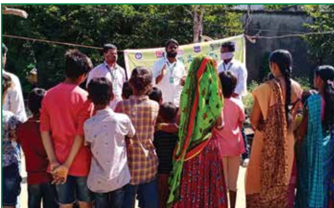
Raising awareness on Child Trafficking