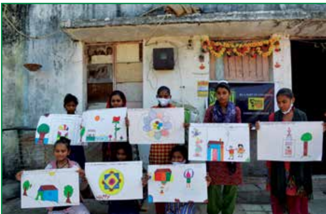
Drawing competition organised by CHILDLINE Amreli, Gujarat

CHILDLINE Amreli celebrated CHILDLINE Se Dosti week in different slum areas of Amreli district. During the drawing competition, children's hands were sanitized, and masks, pencil boxes, sketch pens, drawing paper, biscuits and chocolates were distributed.