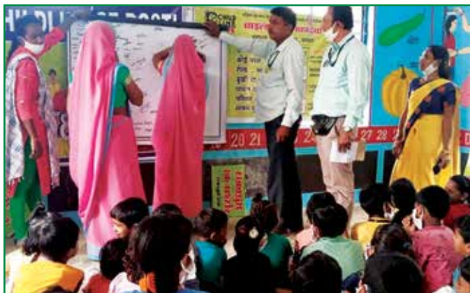
CHILDLINE Khandwa celebrated CHILDLINE Se Dosti week with Gram Panchayat members signing the campaign

Railway CHILDLINE Khandwa conducted an awareness session on CHILDLINE and its functioning with the City Kotwali and CHILDLINE Khandwa.