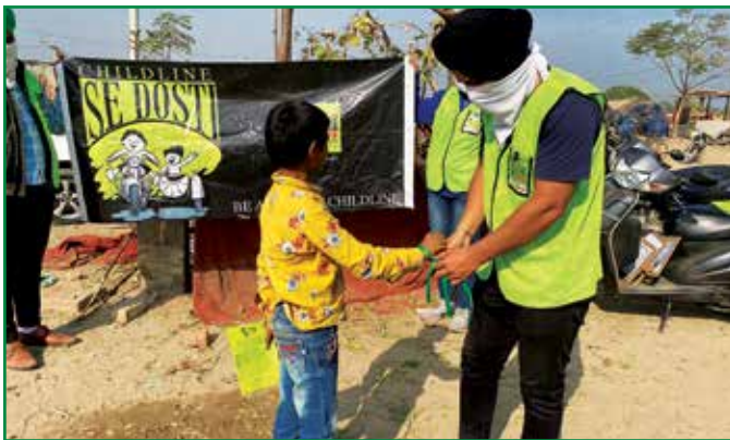
Tying Suraksha Bandhan Band to children in Mohali, Punjab