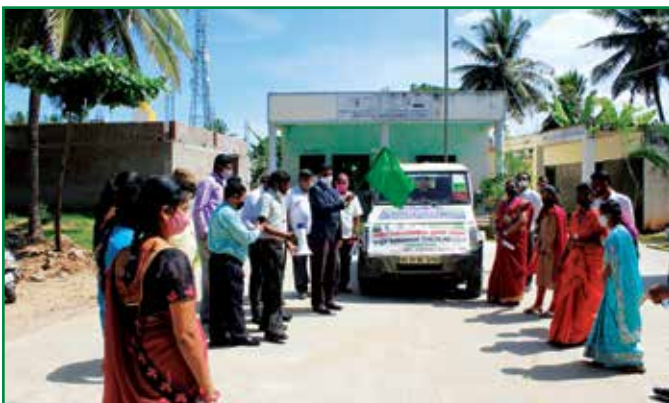
Inauguration of CHILDLINE Se Dosti week at Ramanagara in Karnataka

Since more calls were reported to CHILDLINE from Magadi, a taluka in Ramanagara. The inauguration of the CHILDLINE Se Dosti week was conducted here with the theme of preparing participants as whistleblowers in their community, and to stand against abuse and violence as well as, create a child-friendly panchayat.