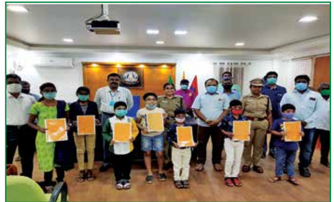
Children with police officials holding placards on Child Rights