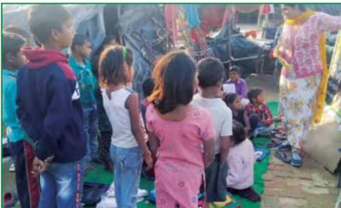
Awareness session being conducted by the CHILDLINE team