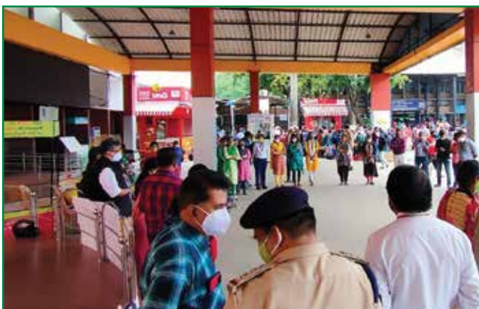
DCPO Bengaluru spoke about CHILDLINE's work on Child Welfare