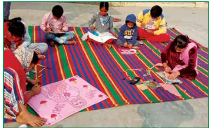
Children's Poster competition in Hoshiarpur, Punjab during CHILDLINE Se Dosti week

the signature campaign. A short session on Drugs Abuse was taken by the Manager of Drugs De-Addiction and Rehabilitation Centre while, dance, poem recitation, speeches and nukad natak were conducted by the CHILDLINE Team for slum children.