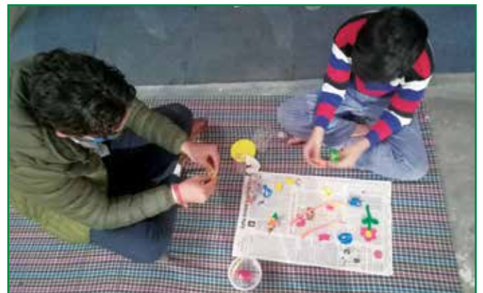
CHILDLINE Ambala, organises clay modeling workshop during the CHILDLINE Se Dosti week