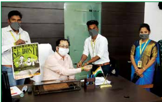
CHLDLINE Barwani tied the Dosti band to Nagar Pallika official during CHLDLINE Se Dosti week