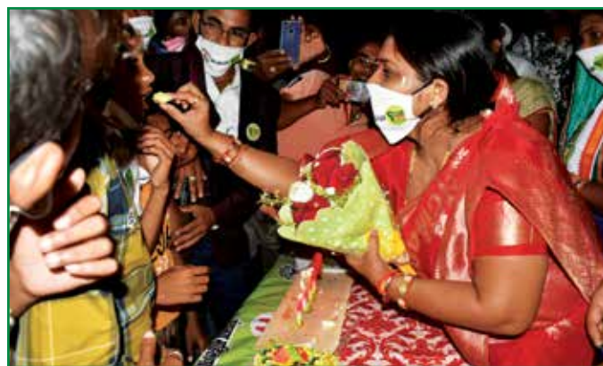
People attending an event during CHILDLINE Se Dosti week

CHILDLINE Kabirdham, organised a rangoli and drawing competition for the children in which they actively participated. The children visited DPO and JJB Magistrate and tied a friendship band to build a strong & friendly bond with them.