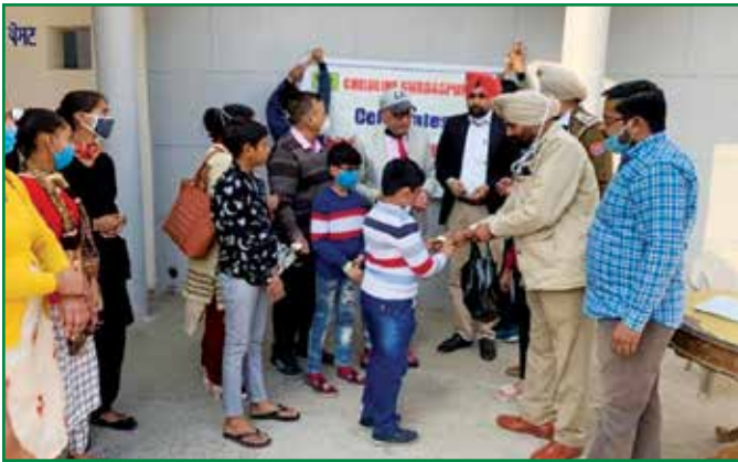
Tying of the friendship bands to police officials at Gurdaspur

CHILDLINE Gurdaspur, held a 'Street Rally' in the city of Gurdaspur to raise awareness on child related issues, and the services of CHILDLINE 1098.