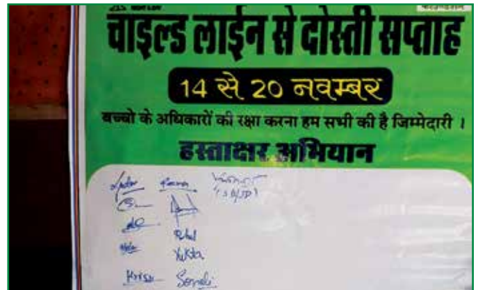
Signature campaign in Jaipur, Rajasthan

Jaipur Railway CHILDLINE Help desk celebrated Children's Day and started CHILDLINE Se Dosti week activities on the same day. CHILDLINE partners organised an open house close to the station near a Govt. Railway Hospital.