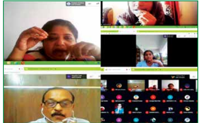
Children interact with District Level Officials - Panel Discussion, Thrissur, Kerala

A panel discussion was organised in which children’s questions relating to Covid-19, education, Child Rights etc. were answered. The Principal, District and Sessions Judge-Thrissur, Secretary (Subjudge), District Legal Services Authority (DLSA)-Thrissur, Chairman, Child Welfare Committee (CWC)-Thrissur, Deputy Director of Education (DDE)-Thrissur, Superintendent of Police (SP)-Thrissur Rural, Protection Officer, Institutional Care, District Child Protection Unit (DCPU)-Thrissur, were the panelists; while those present at the programme included Co-director, Nodal Office, CHILDLINE, Thrissur Director, Railway Child Help Desk, Thrissur, District Coordinator, CHILDLINE, Thrissur, Centre Coordinator, CHILDLINE, Thrissur, Coordinator, Railway Child Help Desk, Thrissur and CHILDLINE team members.