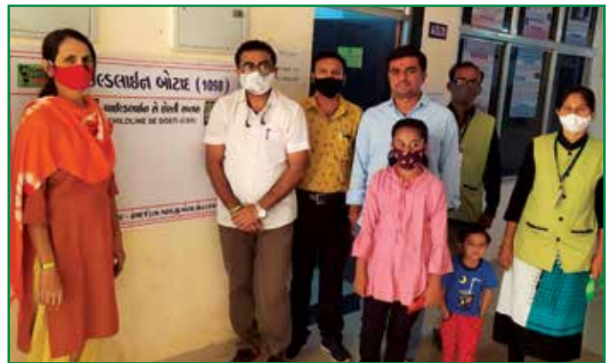
Signing banner & tying the Dosti band to raise awareness