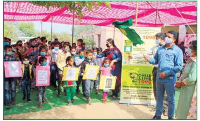
Rally organised by CHILDLINE Jammu