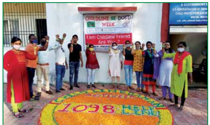
The CHILDLINE team tied dosti bands to Govt. Officials