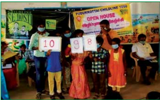
Special open house programme organised by CHILDLINE