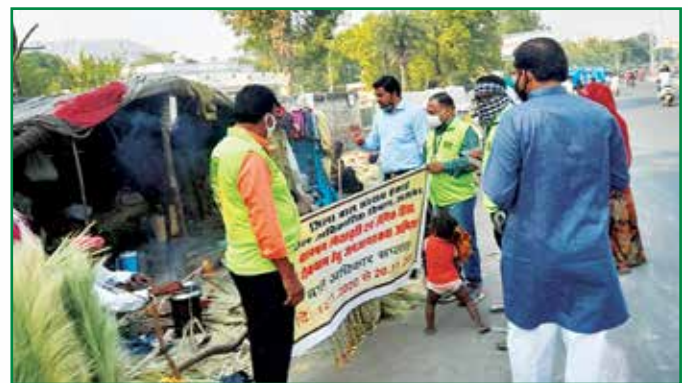
CHILDLINE team conducting a COVID-19 awareness session

While the world faced an unprecedented lockdown, CHILDLINE 1098, remained operative with the punch line "WE ARE NOT LOCKED DOWN!". The line motivated every team member/worker to work under adverse circumstances.