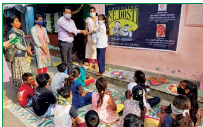
CHILDLINE Ujjain distributing prizes during CHILDLINE Se Dosti week

CHILDLINE Ujjain organised several games for children during the CHILDLINE Se Dosti week. The winners of the games were rewarded with several prizes. This was followed by tying the Dosti band to CWC members.