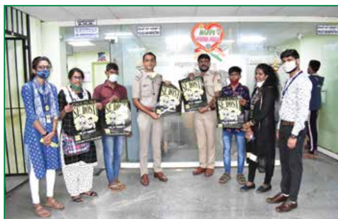
Awareness drive conducted by CHILDLINE team at a Police Station

The guests and dignitaries released posters on the theme of "Anti Child Trafficking" the programme closed with the CHILDLINE Director thanking guests for attending the programme.