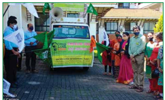
Inaugurating CHILDLINE Se Dosti week and the Children's Day programme in Udupi, Karnataka

CHILDLINE Se Dosti week was inaugurated at the District Administration Office, Rajatadri, Udupi in association with District Legal Services Authority, Udupi and Labour Department, Udupi District, Child Labour Planning Society, Udupi. The Director of CHILDLINE Udupi welcomed the dignitaries & guests present, and emphasized on the importance of the CHILDLINE Se Dosti week programme.