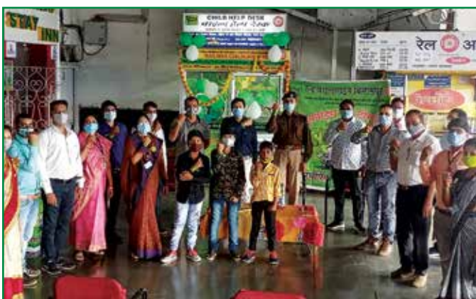
CHILDLINE Se Dosti week celebration with Station Director, RPF, GRP, CSM & Station staff

CHILDLINE Bilaspur, began the CHILDLINE Se Dosti week by cutting a cake for children in the presence of the police superintendent. As part of the CHILDLINE Se Dosti week celebrations, a sports event was organised for children. The team also organised an essay writing competition, where children were given one topic to write about. Later, a cleanliness drive was held to highlight the importance of health and hygiene. CHILDLINE Bilaspur, also conducted a signature campaign in support of Child Rights.