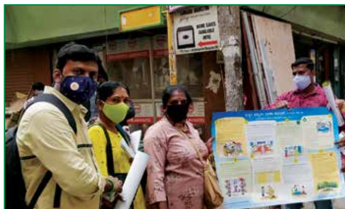
CHILDLINE Team creating awareness about Child Labour