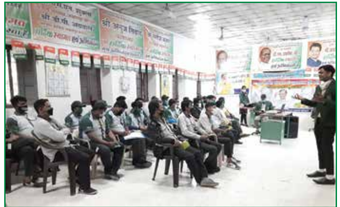
Railway CHILDLINE Bhopal organised a sensitizing workshop with all stakeholders during CHILDLINE Se Dosti week

During the CHILDLINE Se Dosti week, the CHILDLINE team conducted an open house for children at Shankracharya Nagar area with the support of the police. Children were made aware about the safe and unsafe touch, along with the services of CHILDLINE 1098.