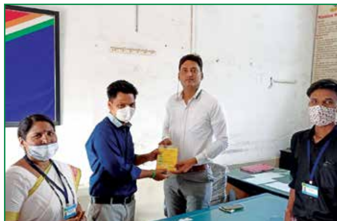
Greeting card distribution to RPF staff 3 rd Activity photos

CHILDLINE Surat celebrated the CHILDLINE Se Dosti week by hosting activities like, getting children to speak up using the children problem box activity, in line with the PSS manual. This was followed by distributing greeting cards to the Ticket Checker and RPF Staff at the railway station. An awareness campaign on Child Labour was also conducted by the team, as part of the CHILDLINE Se Dosti week programme.