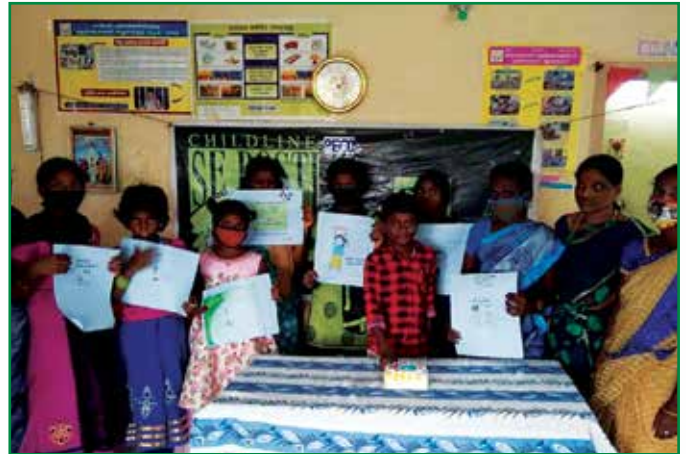
Cake cutting ceremony at Thanjavur