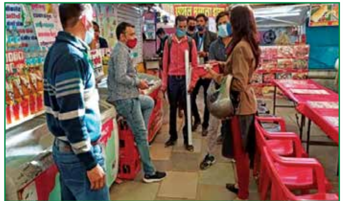
Awareness session on Child Labour