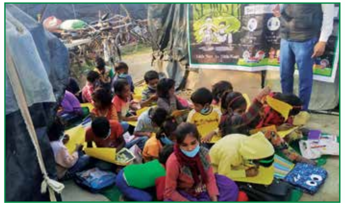
COVID-19 awareness session being conducted