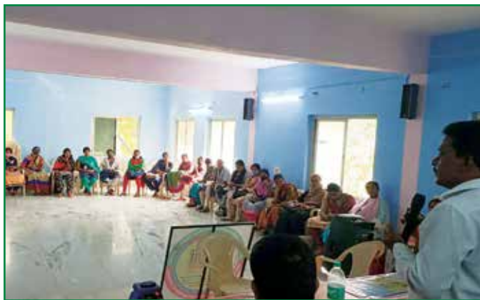
Training village staff in Anantapuram District

The CHILDLINE Se Dosti week in Anantapuram turned out to be an exciting week from the beginning, with a lineup of interesting activities CHILDLINE put together. On Children's Day, the inauguration ceremony was conducted. The team organised a ride for safe childhood. Then a programme was organised for children with special needs by CHILDLINE Anantapuram. This was followed by a Training Programme for Village/ Sachivalayam Staff on the "Importance of Child Protection and Role of the CHILDLINE Partner". A District Level interaction with CHILDLINE Partner along with Municipal and Police Authorities followed, with the Day Against Child Abuse – rally. Among the authorities present were Joint Collector-III, Deputy Commissioner, Department of Women and Child Welfare, Sachivalayam Staff & the Police, Department. The team reached out to 870 children & 3143 adults in total.