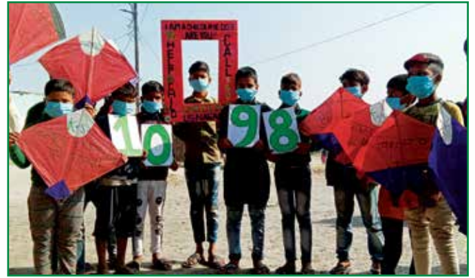
Kite flying programme at Pilibhit

The CHLDLINE team went to Gram Talhad, where the team of CHLDLINE Almora welcomed the Gram Pradhan of the village, and thanked him for allowing CHLDLINE team to conduct the programme. The children were seated on the field following social distancing and masks were distributed. After that, information was shared on Child Rights with details on 1098.