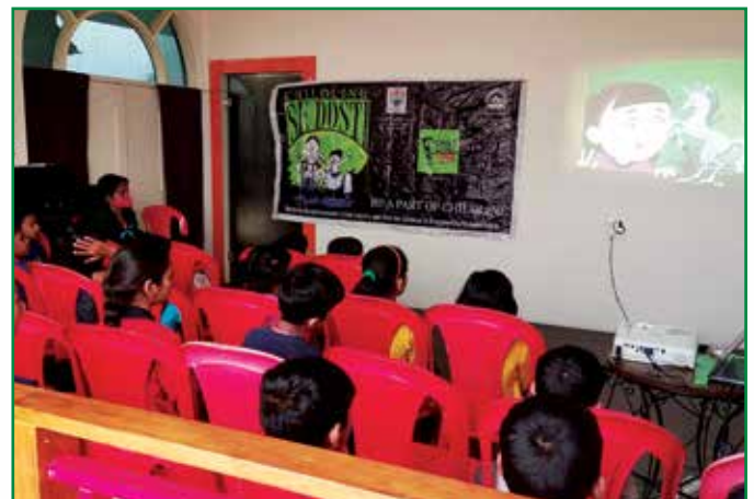
CHILDLINE Bhopal session on POCSO Act for children during CHILDLINE Se Dosti week

The CSP added that we need to identify those peers who are doing good work in Child Rights, and give them due credit, while police can be further sensitized on Child Protection issues by interacting one-on-one with children.