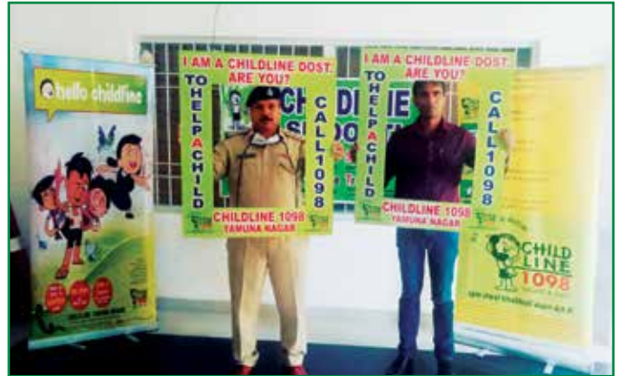
Co-ordination and sensitization programme with police in

CHLDLINE initiated the “CHLDLINE Se Dosti Pakhwara”, a coordination and sensitization programme arranged at City Police station in Jagadhari. The Police were very forthcoming to take pictures against the CHLDLINE Se Dosti frame.