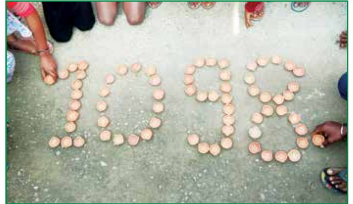
Children prepared CHLDLINE 1098 rangoli with diyas

CHLDLINE Udham Singh Nagar started CHLDLINE Se Dosti week 2020 with a Deepawali Celebration for slum children, where CHLDLINE coordinator shared information about Diwali being a festival of lights. The main objective was to establish coordination among all the departments working for Child Protection and sensitise them about child safety and protection.