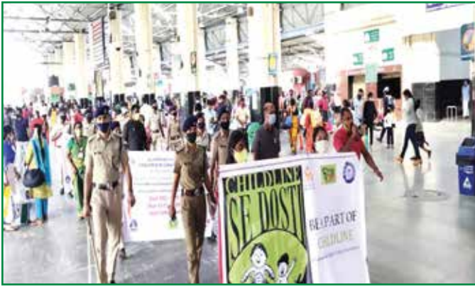
CHILDLINE Se Dosti rally at MGR Chennai Central