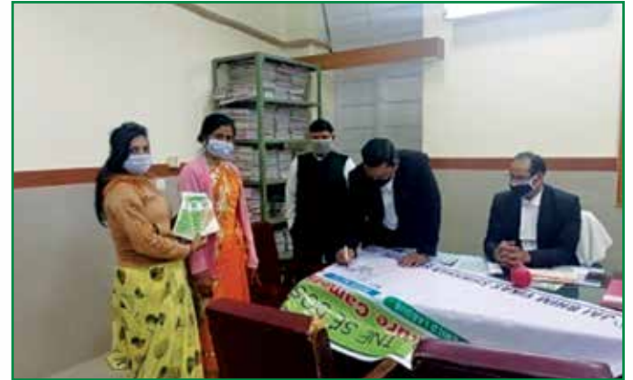
CHILDLINE Jodhpur conducting a signature campaign at Rajasthan High court.