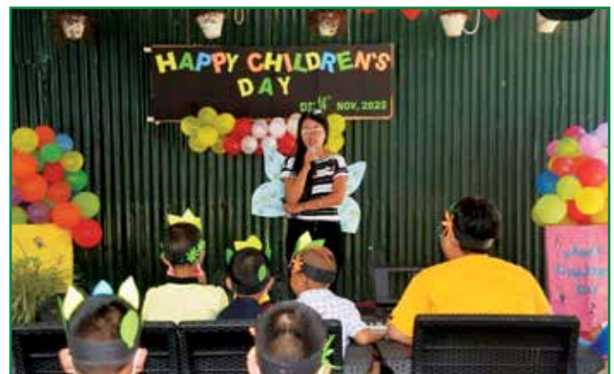
Children’s Day celebration organised by CHLDLINE Mamit during CHLDLINE Se Dosti week

CHLDLINE Mamit, started the Dosti week programme on the Children’s Day, in a children’s home, where DCPO and CHLDLINE team members spoke about the need of care and protection with the children and workers from the home participating in this programme. The event included group singing, dance, recitation, a magic show, several games, and also an eating competition. Pamphlets and decorated sweets bags were also distributed to the driver and children.