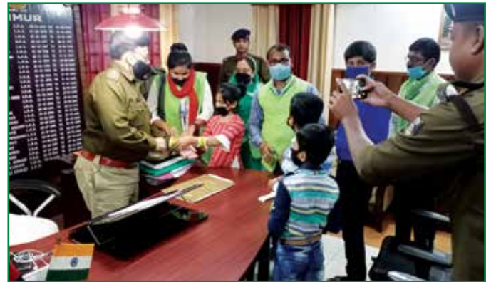
Tying the suraksha bandhan band to SP of Kaimur

CHILDLINE Rohtas celebrated CHILDLINE Se Dosti week programme by tying a suraksha band to the District Administration to appreciate them for their continuous support in ensuring Child Protection. Different activities were also organised by the team for school going children for better awareness.