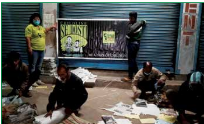
CHILDLINE Dimapur held an awareness program on CHILDLINE 1098, where leaflets were distributed to all households