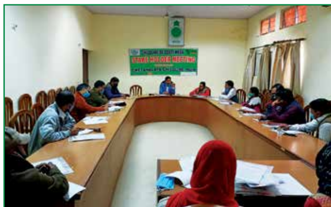
Stakeholders meet during the CHLDLINE Se Dosti week, Mewat, Haryana

The inaugural programme was planned at a CHLDLINE partner’s office on Children’s Day and Diwali too. The CHLDLINE Se Dosti week programme was inaugurated by children who lit the lamp. A drawing and painting competition was held on the theme for children from three NCPs Kherli Kalan, Adber I and II. The winners were given prizes, and an orientation on atrocities against children was conducted, and how to cope up with the present pandemic situation.