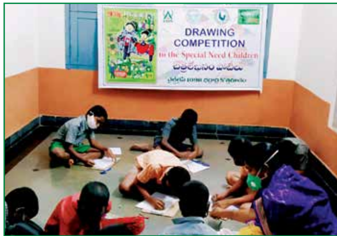
Drawing competition for children with special needs—to encourage them in some extra circular activities, Bhadradi Kothagudem

A CHILDLINE team spoke about CHILDLINE 1098 and explained the programme schedule of CHILDLINE Se Dosti week via video with a press note. Besides, the poster inauguration by Addl. Collector IAS and Addl. Collector of Bhadradi Kothagudem, Addl. Collector participated with family members to celebrate Children's Day and Diwali with the children.