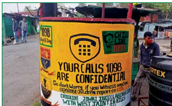
Wall painting during CHILDLINE Se Dosti week

Children's Day was celebrated at Jowai, Assam, as part of the CHILDLINE Se Dosti week. The programme began at 11:00 am, and a CHLDLINE team member chaired the programme of the day.