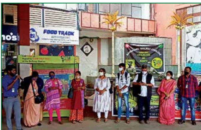
DCPO Bengaluru spoke about CHILDLINE's work on Child Welfare