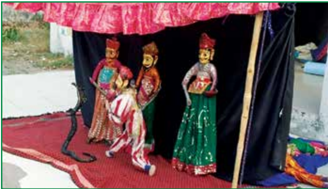
CHILDLINE Vadodra celebrates CHILDLINE Se Dosti week with a puppet show

On the occasion of World Child Rights Day, a Human Chain was organised at Fatehgunj Circle with banners "Right to Live, Right to Development, Right to Protection and Right to Participation" along with CHILDLINE Se Dosti banners with the message "I am a CHILDLINE Dost, are you?". The Dean and the Director, Nodal Agency, Faculty of Social Work, was present with his Human Chain which was organised on Child Rights day in Fatehgunj, Vadodara.