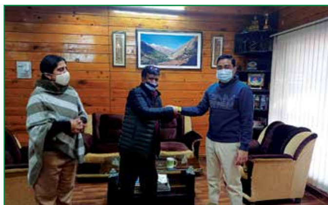
Tying the Suraksha Bandhan Band to the Superintendent of Police in Kullu, Himachal Pradesh

CHILDLINE Kullu celebrated CHILDLINE Se Dosti week by hosting many activities including tying the Suraksha Bandhan to the Superintendent of Police in Kullu. The CHILDLINE team organised a dance, singing and poetry competition at a Kullu Slum, where the CWC Chairman attended the event as Chief Guest.