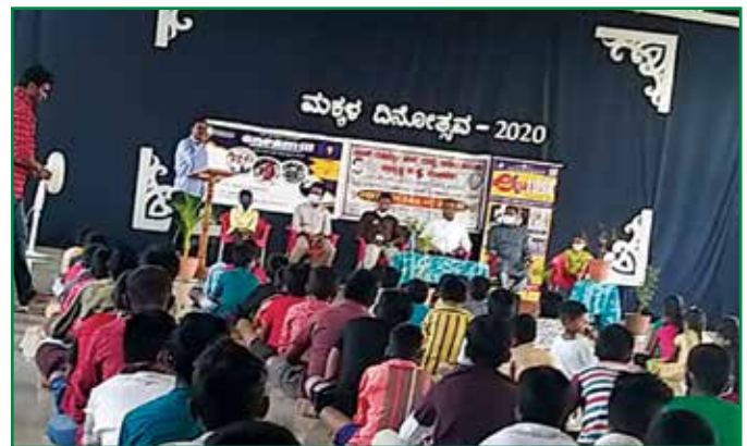
CHILDLINE Se Dosti week inaugural function at District Boys Home in Bellary, Karnataka

CHILDLINE Bellary organised the CHILDLINE Se Dosti 2020 programme at, District Boys Home and District Child Protection Unit, Bellary. The programme was inaugurated by the Deputy Commissioner.