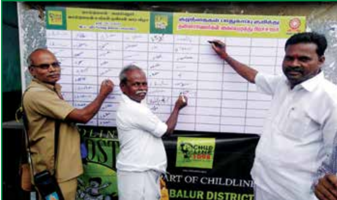
Signature campaign by CHILDLINE Perambalur at the bus station