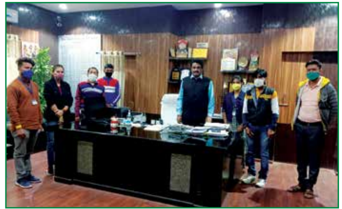
CHILDLINE partner at Tikamgarh after tying a friendship band to the new District Collector

CHILDLINE Tikamgarh conducted a meeting with the new District Collector and tied him the dosti band. The team also shared information about the work and activities done by CHILDLINE.