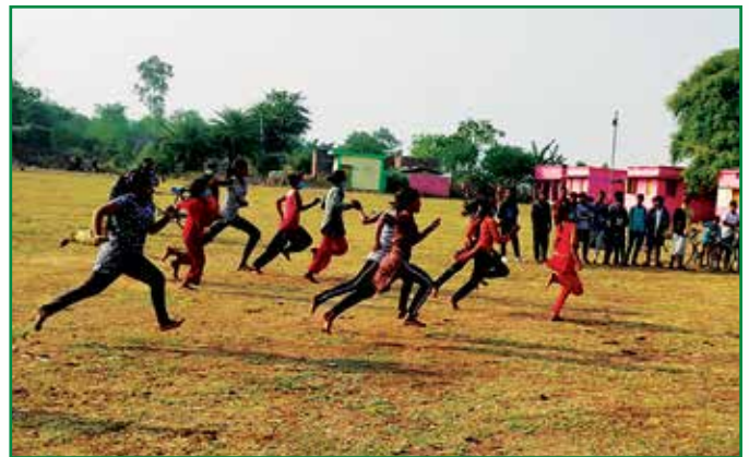
Running race for children organised by CHLDLINE Panna during the CHLDLINE Se Dosti week

As a part of the CHLDLINE Se Dosti week programme, CHLDLINE Panna organised a running race for the children of Brijpur village, in the district. Before the race, the team shared information on CHLDLINE 1098 with the children, to make them aware that we are there for them. Around 70 children participated in the programme.