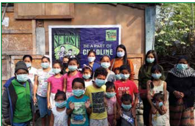
CHLDLINE South Sikkim Team spreading awareness on Covid 19 during CHLDLINE Se Dosti week