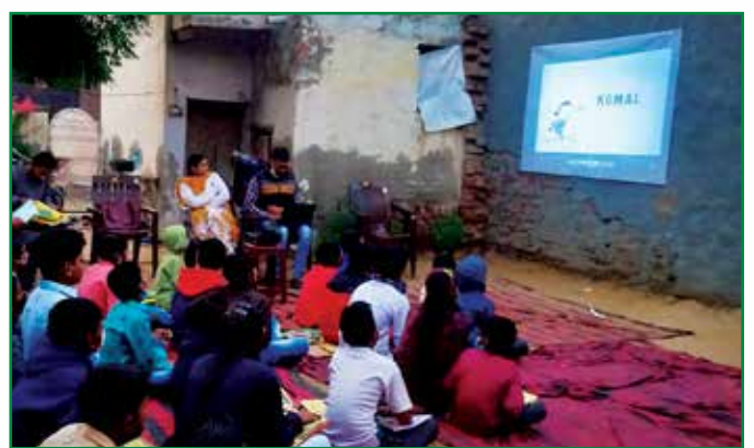
Komal movie was shown to children