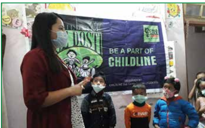
Awareness drive on COVID for children during CHLDLINE Se Dosti week in West Sikkim

In West Sikkim, CHLDLINE Se Dosti week was celebrated with different allied systems, children, students and public of the district.