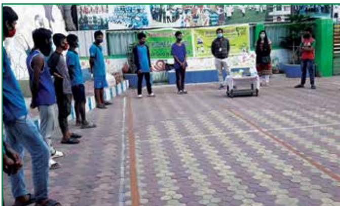
Children enjoying sports activities organised by the team in Guwahati

On the occasion of the Children's Day, CHILDLINE Guwahati organised a special awareness programme at an Open Air Campus. The programme started with cake cutting, around 40 persons including children participated in the programme. The objective of the programme was to raise awareness on CHILDLINE 1098 and sensitize them on the issues of Child Rights, Covid Safety, Child Protection mechanisms etc.