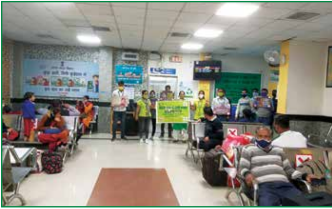
Awareness Rally at Jaipur Railway station, Rajasthan