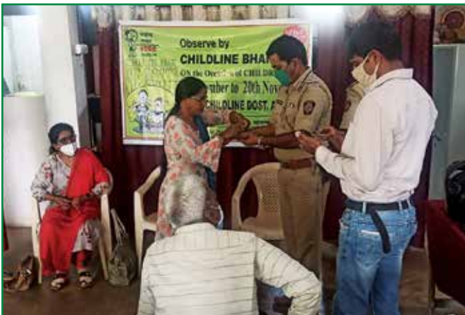
CHILDLINE Bhandardara tied friendship bands to Police officers in Warthi on 17 th November 2020

CHILDLINE teams in Bhandara celebrated CHILDLINE Se Dosti week by organising various awareness campaigns and strengthening their ties with stakeholders, by tying the Dosti band.