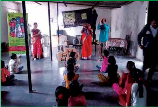
CHILDLINE Beed celebrating CHILDLINE Se Dosti week with games for children

CHILDLINE Beed celebrated CHILDLINE Se Dosti week with different games to engage children. During the programme the team raised awareness on CHILDLINE 1098 and Child Rights.