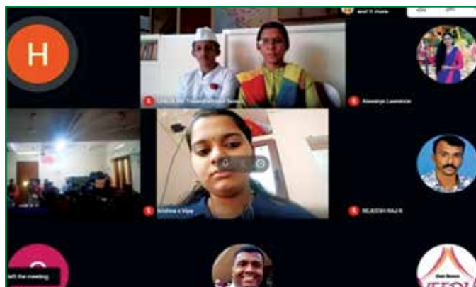
Online meeting on Child Abuse