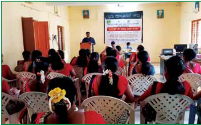
Training & awareness session with Anganwadi workers.

CDPO inaugurated the CHILDLINE Se Dosti programme, with Anganwadi teachers helping with the children’s helpline the following day.