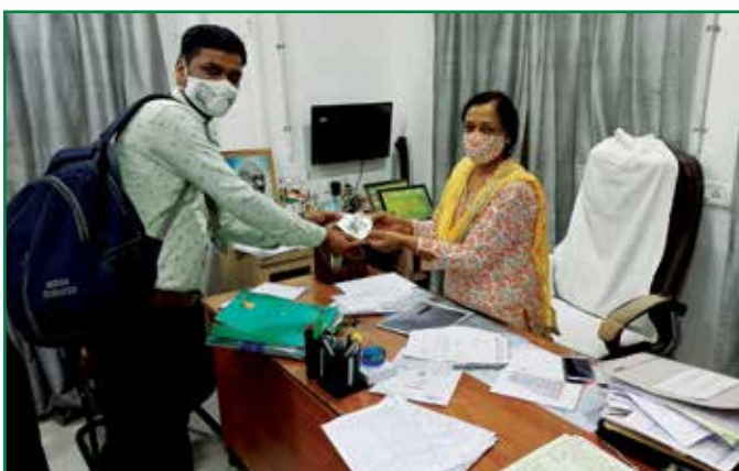
Giftng printed mask to Asst. Commissioner Labour dept.

Railway CHILDLINE team started CHILDLINE Se Dosti week by cutting a cake on the occasion of Children’s Day with children from slum areas. The CHILDLINE team then set out to convince