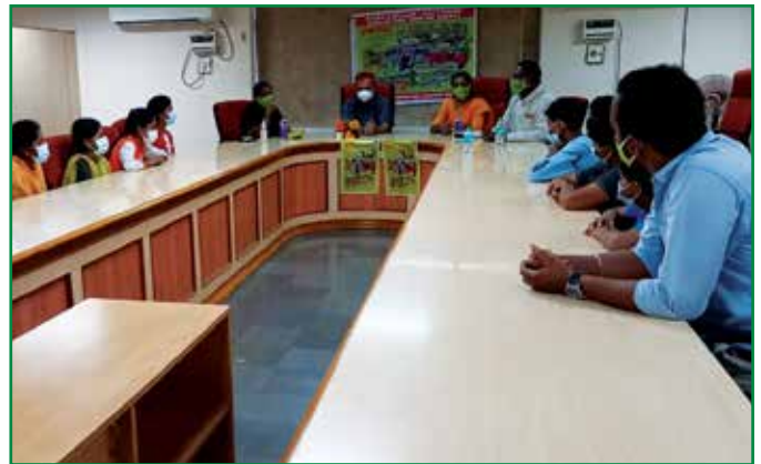
Children shared their thoughts with the Deputy Commissioner of Labour

the importance of Child Protection. A total of 201 children & 1215 adults attended the programme.