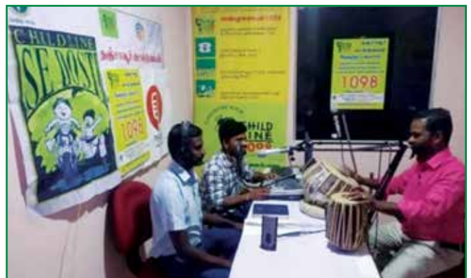
Radio programme on "CHILDLINE 1098 and stopping Child Marriage"

The pandemic never stopped the CHILDLINE Se Dosti celebrations in the state of Tamil Nadu. Instead, we were in full swing and reached out to all the stakeholders, and talking to them about the rights of children and CHILDLINE 1098. A drawing competition was held for children with the title "My Happy World", which was conducted by district CHILDLINE.