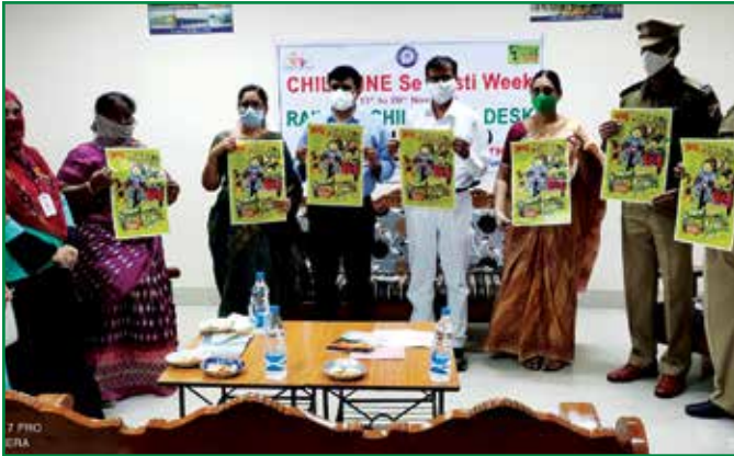
CHILDLINE at Khammam Railway Station for the release of the CHILDLINE Se Dosti poster

CHILDLINE Se Dosti week was celebrated in Khammam with district officials, and all railway stakeholders took an oath to join hands with CHILDLINE 1098, after a discussion on Child Trafficking, A few songs on Child Rights were played to raise awareness at the Railway Child Help Desk. Awareness was also raised on the Covid-19 protocol and social distancing.