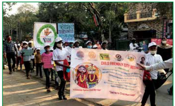
Rally in Chandigarh by CHILDLINE during the CHILDLINE Se Dosti week