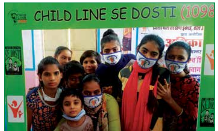
The CHILDLINE Se Dosti photo frame