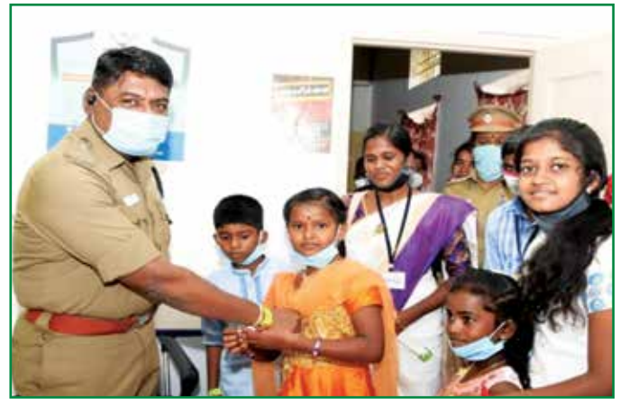
Children tying dosti band to Police Official