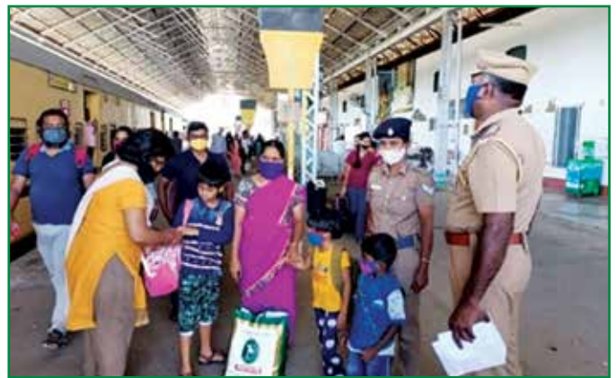
CHILDLINE team members explaining about CHILDLINE 1098 services

During the CHILDLINE Se Dosti week, the team observed the 31 st anniversary of UNCRC (United Nations Convention on the Rights of the Child) with a programme at Dr. MGR Central Railway Station in collaboration with the Railways, Railway Protection Force (RPF), and Government Railway Police (GRP), to create awareness among railway passengers about CHILDLINE 1098. Passengers were requested to report any child or children found in the railway premises or on moving trains, who were missing, runaways, trafficked, lost, abandoned or abused.