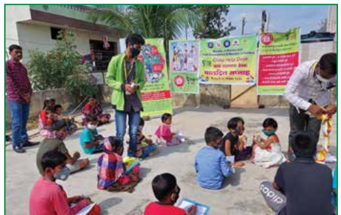
Railway CHILDLINE Solapur organised an essay writing competition during CHILDLINE Se Dosti week