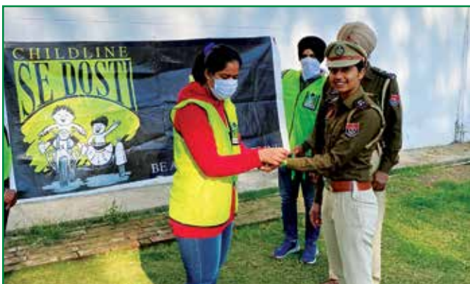
CHILDLINE Se Dosti week celebrations with Punjab police in Mohali, Punjab