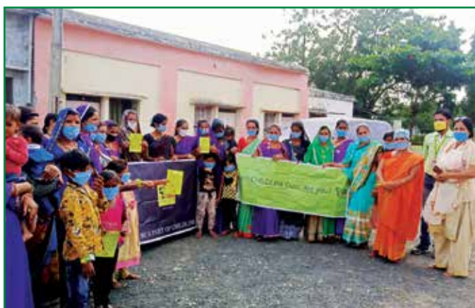
CHILDLINE Ratlam conducting awareness campaign with ASHA workers

The CHILDLINE Se Dosti celebration in Ratlam started with a session on awareness with ASHA workers, where information on CHILDLINE 1098 was shared along with the role of ASHA, in protecting Child Rights. Around 40 ASHA workers participated in the session.