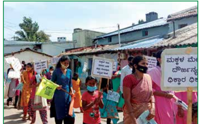
World Prevention of Child Abuse Day rally in Davanagere, Karnataka, during the CHILDLINE Se Dosti week

The team organised a rally on World Day on the prevention of Child Abuse. The rally was flagged off by PDO, Kakkargolla GP. The rally aimed to sensitize the village people on Child Abuse, Child Rights and CHILDLINE1098.