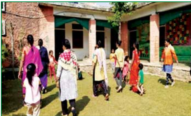
Awareness session at a shelter home, Udaipur.