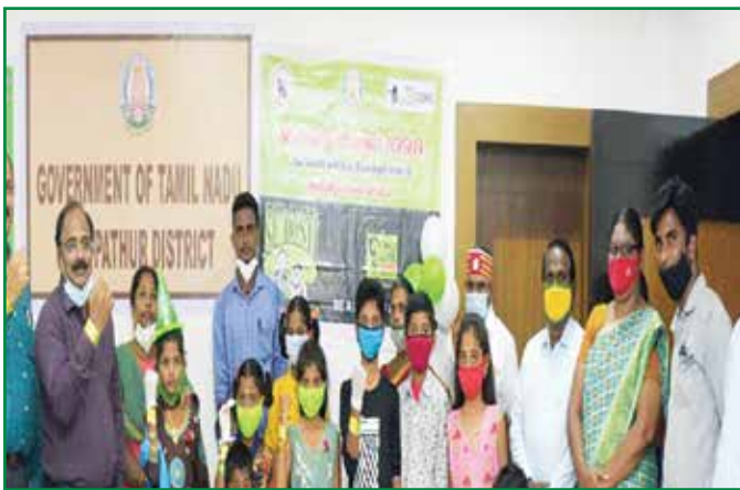
CHILDLINE team celebrate Dosti week in Tirupathur