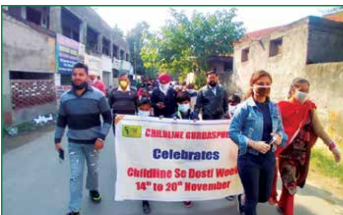
Rally organised by the CHILDLINE team during Dosti week