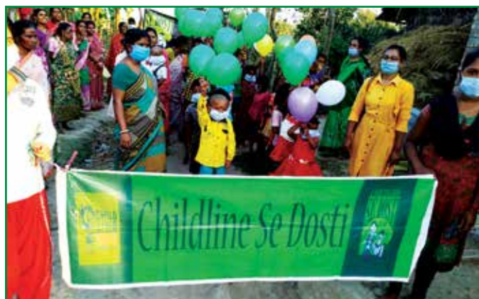
CHILDLINE Se Dosti Banner

CHILDLINE Kolkata conducted a signature campaign which was supported by Police Officers, eminent Social Activists, Local Leaders, Ward Councilors, WBCS Officials, Urban Development Ministers and Doctors. The Nodal Organisation of CHILDLINE Kolkata, organised a signature campaign against Child Marriage in association with West Bengal Commission for Protection of Child Rights. Different dignitaries like the Chairperson and the members of WBCPCR State Police personnel, NGO personnel, and children signed the banner.