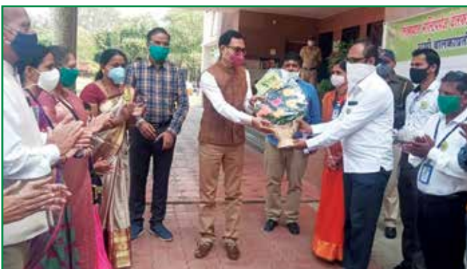
CHILDLINE Se Dosti programme inaugurated by District Collector

The team celebrated CHILDLINE Se Dosti with the Station Manager, RPF & GRP inaugurating the programme. An essay writing competition was also held by the Railway CHILDLINE Solapur team.