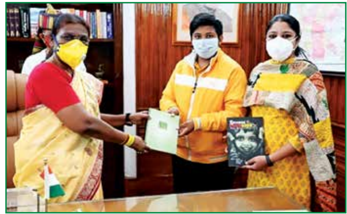
During CHILDLINE Se Dosti week, the team visited Raj Bhawan and presented the Governor with special edition of CHILDLINE diary

The CHILDLINE Se Dosti programme began with a residential visit to Raj Bhawan by the City Coordinator who visited the Governor along with a child. As part of the tradition of CHILDLINE Se Dosti week, the CHILDLINE team tied the Dosti band to the honourable governor, and presented her with our special edition diary. The following day, the team tied the Dosti band to the DC, City SP, SDO, Deputy Municipal Commissioner, CWC and the DCPU. The next day the team met and tied the Dosti bands to the Director ICPS, Disability Commissioner, followed by IG-CID Ranchi Railway CHILDLINE.