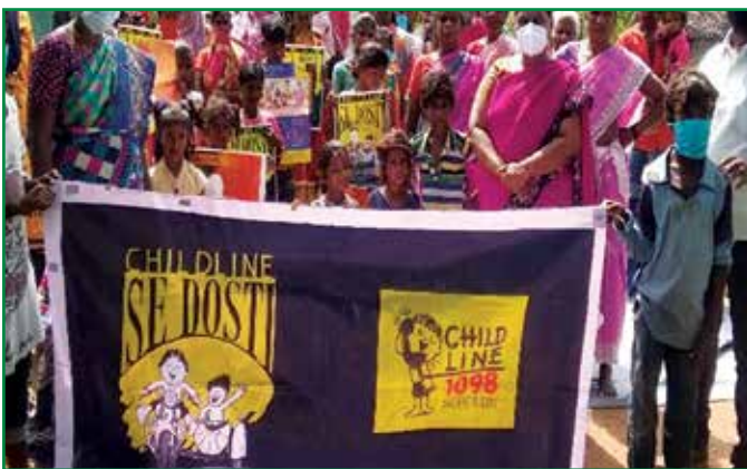
Children with CHILDLINE 1098 banner

CHILDLINE Kanyakumari celebrated CHILDLINE Se Dosti week with a special open house programme organised at Thazhakudy. The village was identified through outreach, and basic assessments were made via a discussion with community members. The team met with local panchayat administrators, anganwadi teachers and SHGs members. Lack of street light, sanitation, child marriage, growth of wild bushes, were the