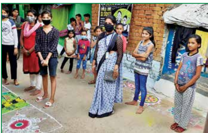
Rangoli competition and winners

CHILDLINE Se Dosti week was celebrated by CHILDLINE Durg with fun-filled activities for children. On the first day of CHILDLINE Se Dosti week, clothes and books were distributed to children on railway stations.