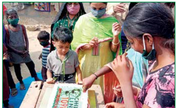
CHILDLINE cake cutting programme

CHILDLINE Kutch celebrated CHILDLINE Se Dosti week as per the following schedule.