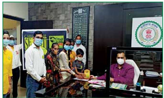
Memento given to DM and Collector at Raigarh

A digital drawing competition was conducted, in which, the entries were submitted to CHILDLINE via email during the CHILDLINE Se Dosti week. This was followed by a ceremony where the children presented a memento to the DCPU, CWC members and the CMHO office.