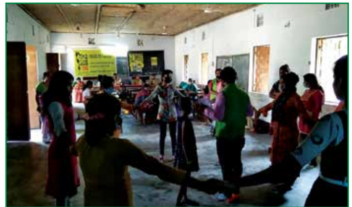
Sports day organised during CHILDLINE Se Dosti week

Dosti Caravan – A tour of Sepahijala district in the CHILDLINE Se Dosti van was organised with tying the Dosti band to officials of Bishalgarh PS, Bishalgarh women PS, Melaghar PS, Sonamura PS, Bishranganja PS, SP Office Sepahijala, DISE-Sepahijala, SDPO-Bishalgarsh, SDPO Sonamura, SDM-Bishalgarh, Sonamura CDPO Office, to thank them for their support of CHILDLINE 1098.