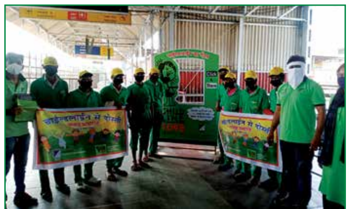
CHILDLINE Se Dosti week celebrations by Railway CHILDLINE Ahmedabad

CHILDLINE Se Dosti week in Ahmedabad started with CHD Ahmedabad distributing pamphlets and booklets on "Safe Touch and Unsafe Touch" to raise awareness among people. The team also distributed masks and sanitizers among railway passengers.