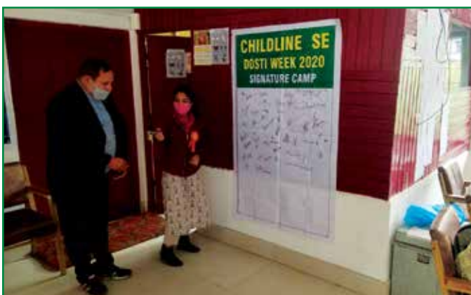
Signature campaign during CHILDLINE Se Dosti week in Hamirpur, Himachal Pradesh

CHILDLINE Se Dosti week was celebrated by CHILDLINE Hamirpur with a range of activities, including a signature