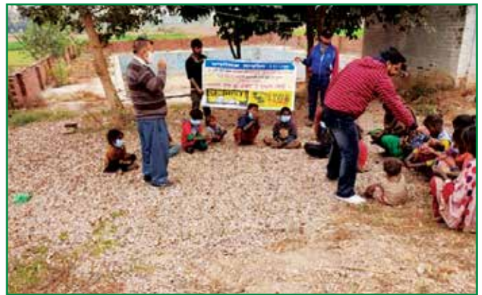
On 15 th November we schooled children on Child Issues and provided masks to children