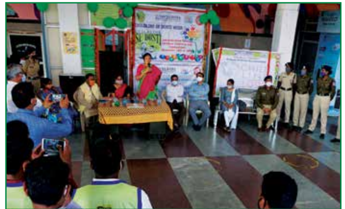
Principal Director of South Central Railway (IA & AS) addressing the CHILDLINE meeting

The CHILDLINE Se Dosti week celebration began with observing the 'World day for the Prevention of Child Abuse' by railway CHILDLINE Secunderabad at the railway station. Principal Director of South Central Railway (IA & AS), the senior DSC, SCPCR member, Station Director, RPF Inspector, the Director of Divya Disha, RPF and GRPF personnel and Railway CHILDLINE team were all present at the programme.