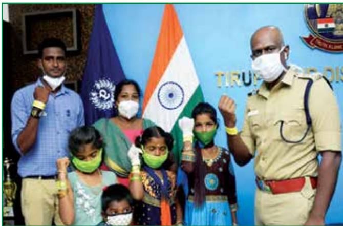
Police official and children at the Dosti week programme