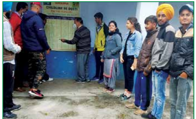
On 16 th November we held a signature campaign, and raised awareness among children about how CHILDLINE is there to support them

CHILDLINE 1098, celebrated CHILDLINE Se Dosti week at a Police Station Gurdaspur under the guidance and supervision of CJM & Secretary District Legal Service Authority. Friendship bands were tied on children's hands by eminent personalities and staff members of CHILDLINE Gurdaspur.