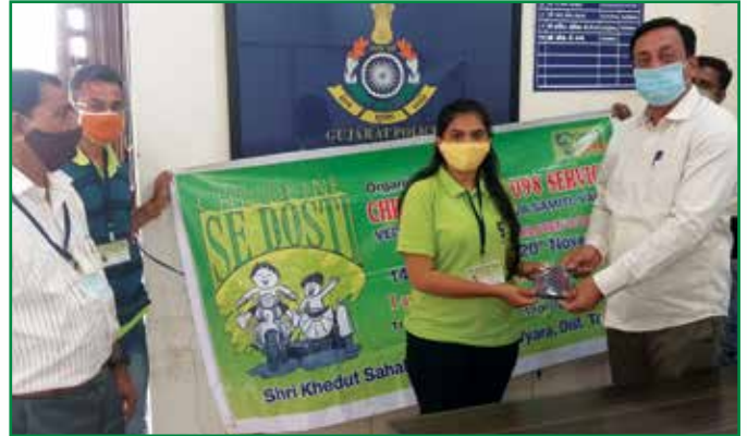
District level officer participates in the mask distribution programme organised by CHILDLINE Tapi