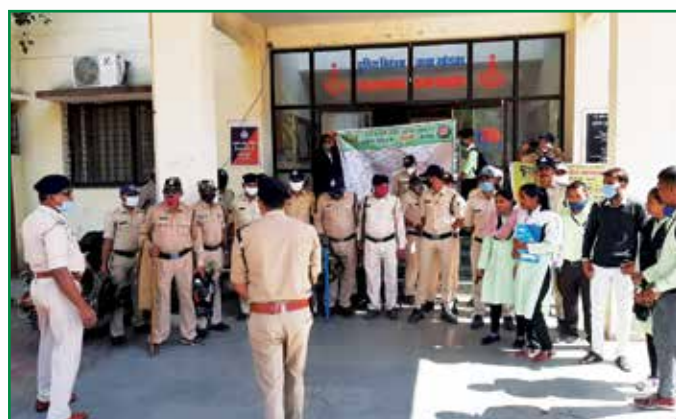
Railway CHILDLINE Khandwa with Police officials creating awareness about CHILDLINE Se Dosti week