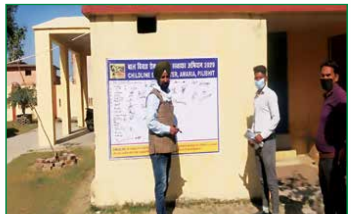
A signature campaign was organised at a village in Amariya, Pilibhit, Uttar Pradesh

In Navadiya Visen, Amariya, Pilibhit the team organised an awareness rally for the prevention of Child Marriage, in the village with an appeal to call CHILDLINE 1098 to stop Child Marriage. Children and women were supported in the programme.