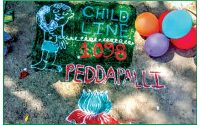
Rangoli logo prepared by children at Peddapalli, Telangana

CHILDLINE Peddapalli organised a drawing competition for children to celebrate CHILDLINE Se Dosti week. The DWO, DCPO, CHILDLINE staff participated in the CHILDLINE Se Dosti week celebration. The CHILDLINE Se Dosti poster was also released by Additional Collector. Children tied the Dosti bands to police station officials and the MRO Office. The team conducted a mandal level advisory board meeting on the issue of Child Marriage.