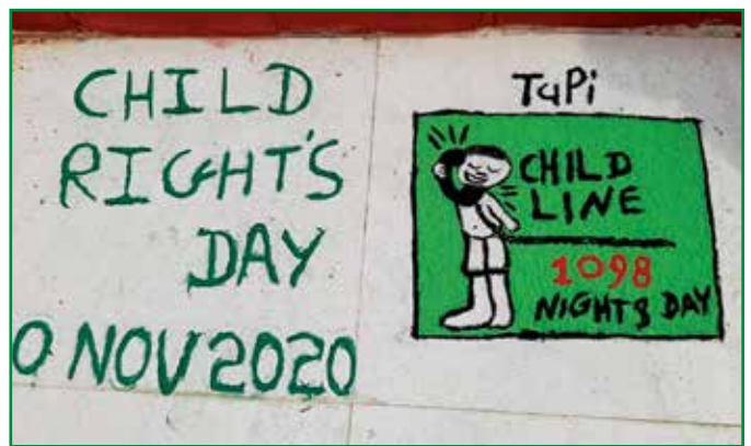
Children's rangoli competition

CHILDLINE Tapi, started the CHILDLINE Se Dosti week programme with a drawing competition for children in a school at Vyara city. The team then shared information on CHILDLINE 1098 services, in relation to child labour, child marriage, children found begging and child abuse. This was followed by some games, where the winners of the competition were awarded notebooks, mathematical tool boxes, writing pads, etc.