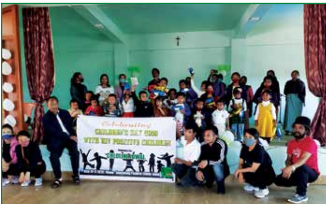
CHILDLINE Se Dosti event with children in Jowai, Meghalaya