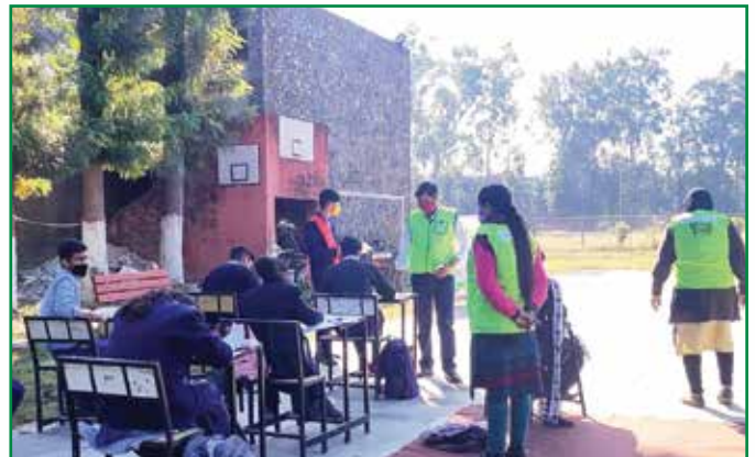
Drawing competition for children in Chandigarh