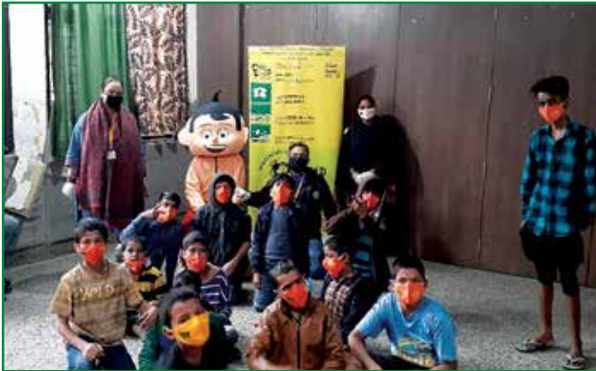
CHILDLINE team member dressed up as “Chotta Bheem” to distribute masks and biscuits to children during the CHILDLINE Se Dosti week

celebrated Diwali and Children’s Day with children. During the CHILDLINE Se Dosti week, one staff member dressed up as Chotta Bheem and went to the local community to spread awareness among children about CHILDLINE 1098. He distributed face masks and biscuits to children.