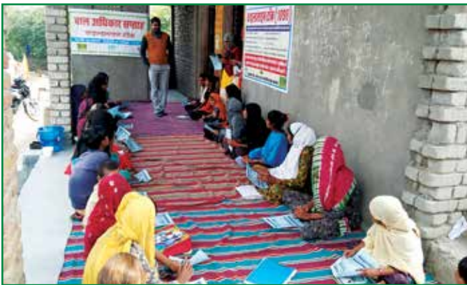
The children also participated in a painting competition