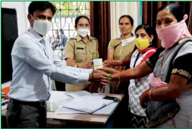
CHILDLINE Latur presents memento & ties band to SJPU Officer on 20 th November 2020