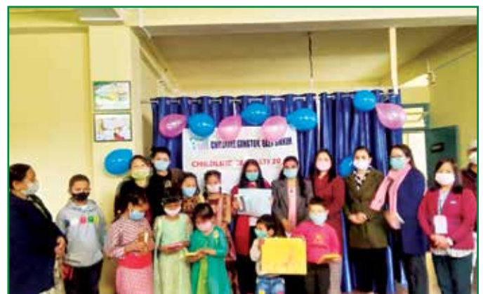
Drawing competition organised during CHILDLINE Se Dosti week at a public school in East Sikkim