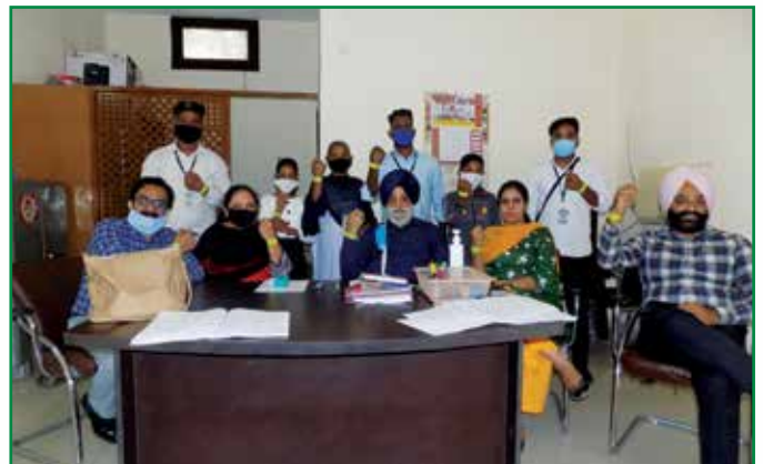
Tying the Suraksha Bandhan Band during CHILDLINE Se Dosti week in Amritsar Punjab