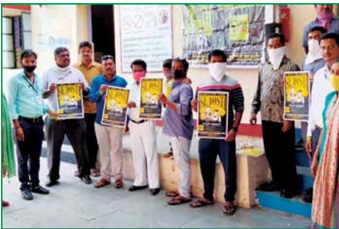
CHILDLINE Latur & railway employees on 19 th November 2020 with wall posters for Latur railway station