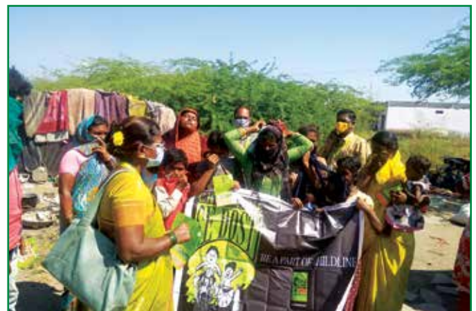
CHILDLINE Sedam organised an awareness programme on Child Begging

CHILDLINE Kalaburagi organised an awareness programme on ‘Child Labour and Child Begging/Street Children’ in Sedam Taluk slum areas.