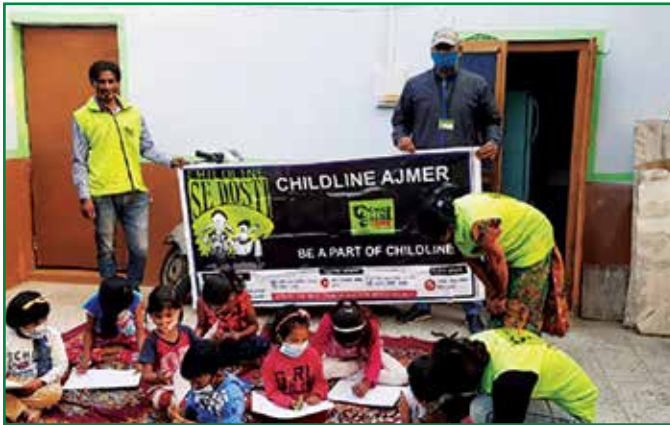
Drawing competition was organised for school children at Madar Colony, Ajmer