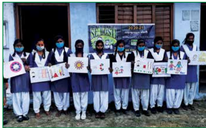
Art competition organised at a school in Pilibhit, Uttar Pradesh