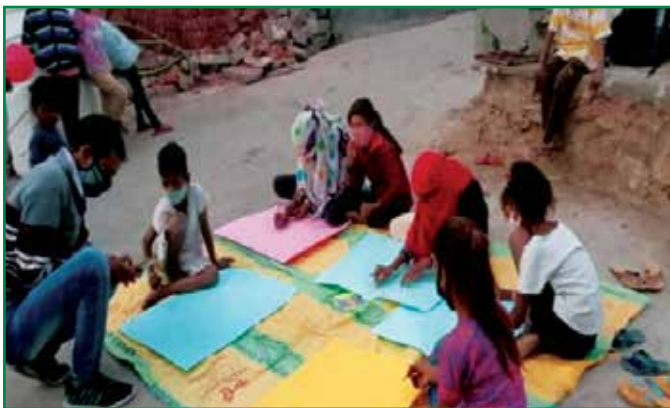
Children at the Poster making competition