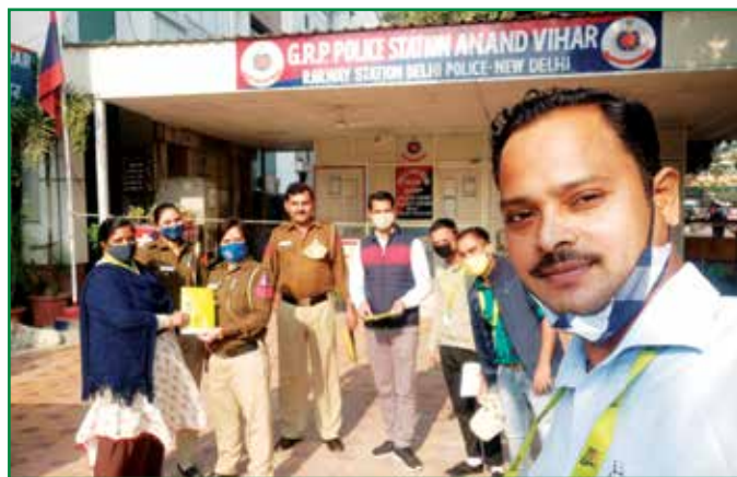
CHILDLINE Se Dosti week celebrations with GRP in Anand Vihar, Delhi

CHILDLINE Delhi also organised a “Sports Day” programme for children at the park with various activities like lemon race, race simple, frog race, chair game etc. for children.