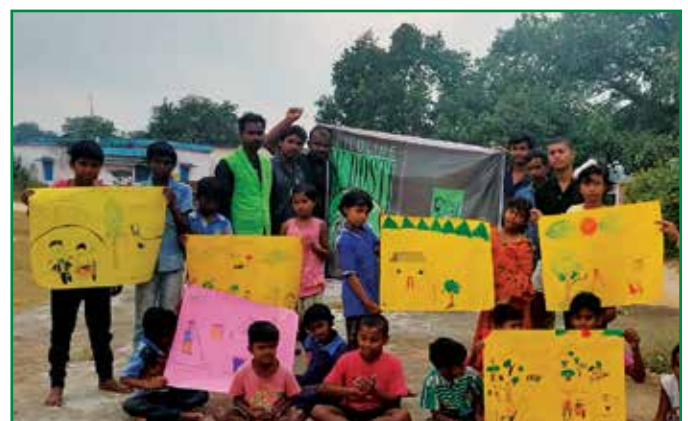
Painting competition organised for children by CHILDLINE Surguja

The CHILDLINE Se Dosti week programme started with a 'Mehendi' competition in Ambikapur, and then an awareness programme was organised on CHILDLINE1098 services.