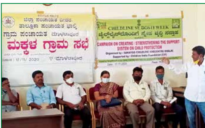
Campaign to strengthen the support system for Child Protection

As part of the CHILDLINE Se Dosti week 2020, CHILDLINE Bidar conducted an awareness programme to strengthen the support