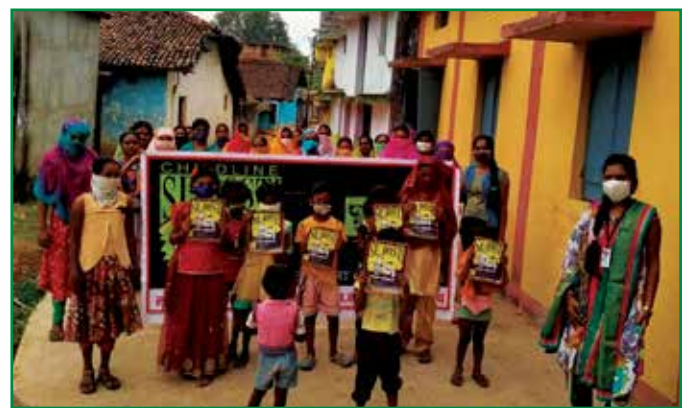
CHILDLINE Se Dosti awareness rally with children and community

This was followed by a signature campaign, where the team got the people to pledge and support Child Rights.