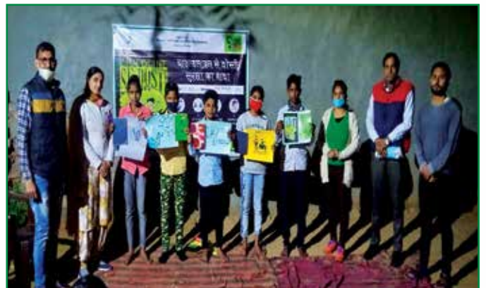
Children holding placards on Child Rights