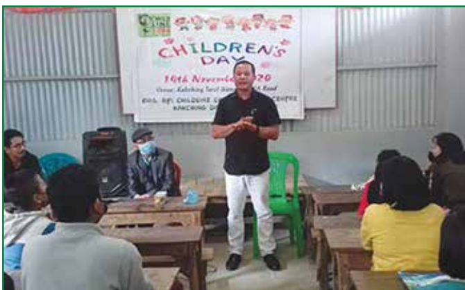
Conducting an Awareness Programme, CHILDLINE Kakching, Manipur

On the Children's Day, CHILDLINE Kakching raised awareness about Child Rights. The function was attended by 54 participants, where sweets, exercise books and pens were distributed by the Director.