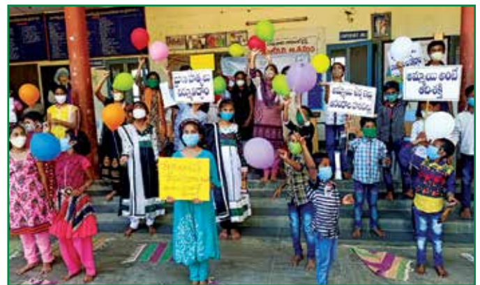
Children celebrating CHILDLINE Se Dosti at a CHILDLINE partner's facility