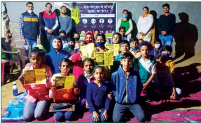
Distribution of fruits at Hisar