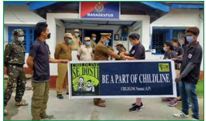
CHILDLINE Namsai team tying friendship bands to the police officers during CHILDLINE Se Dosti week

CHLDLINE Namsai organised some games for children who participated actively. The next day a rally was organised with children to generate awareness on basic Child Rights. The team also distributed face mask among children.