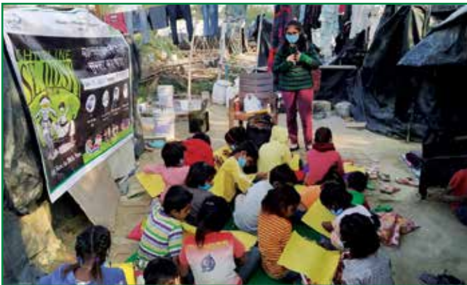
CHILDLINE Se Dosti week being organised in slum areas