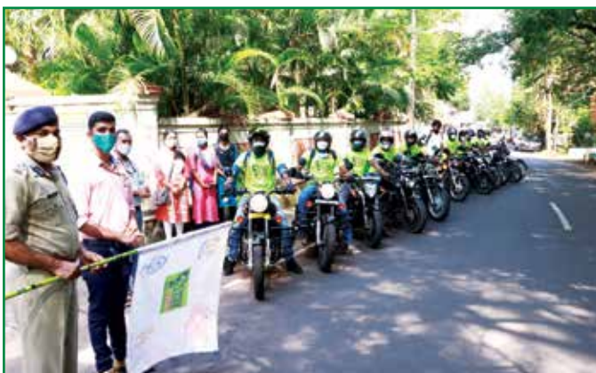
Ride for safe childhood from Kannur to New Mahe

In observing World Day for the Prevention of Child Abuse, CHILDLINE Kannur organised a bike rally from Kannur to New Mahe.