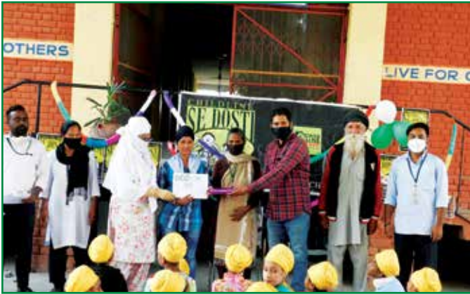
Drawing competition and games for children during the CHILDLINE Se Dosti week in Amritsar

out to more than 1500 concerned individuals.