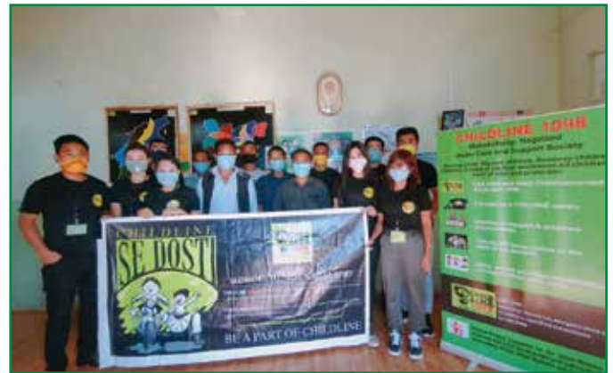
Launching poster campaign by CHILDLINE Dimapur, Nagaland.

The “CHILDLINE Se Dosti” campaign 2020 started off with the launch and release of a video documentary titled “Shattered Dreams” on Child Protection and CHILDLINE 1098.