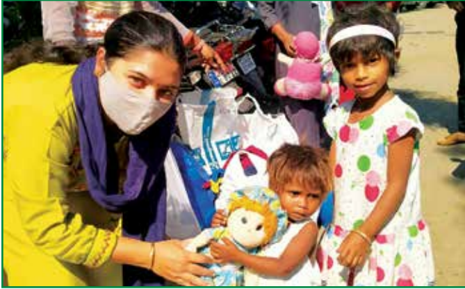
CHILDLINE team distributed toys to children