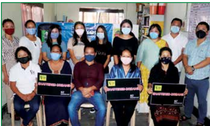
Launch of video documentary “Shattered Dreams” in Dimapur, Nagaland

The “CHILDLINE Se Dosti” campaign 2020 started off with the launch and release of a video documentary titled “Shattered Dreams” on Child Protection and CHILDLINE 1098.