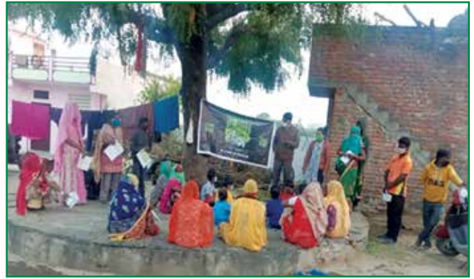
Community awareness programme on CHILDLINE 1098 at Bedla district, Udaipur