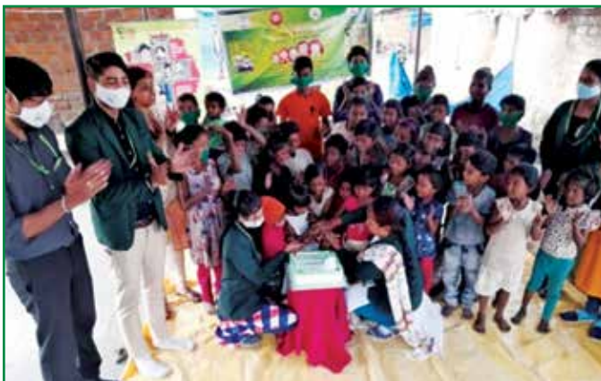
Cake cutting ceremony with slum children