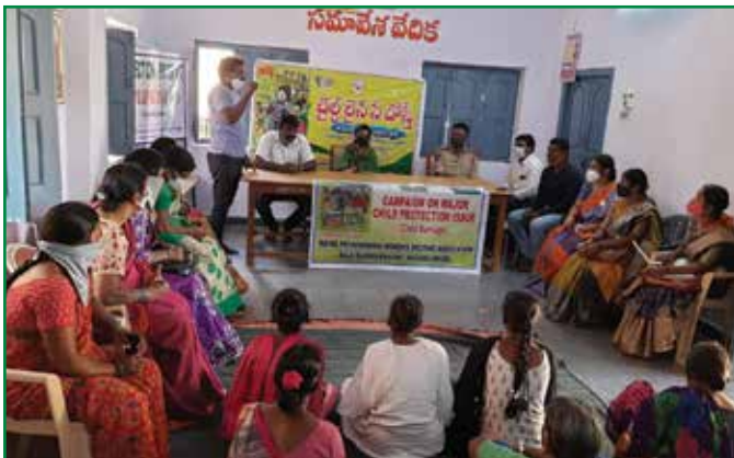
Campaign against Child Marriage in Nagarkurnool, Telangana

On the occasion of CHILDLINE Se Dosti week, CHILDLINE Nagarkurnool spread awareness on CHILDLINE 1098 in the slum areas, and sensitized people about protecting Child Rights. The target group included children's colonies and surrounding communities.