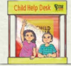
CHILD HELP DESKS